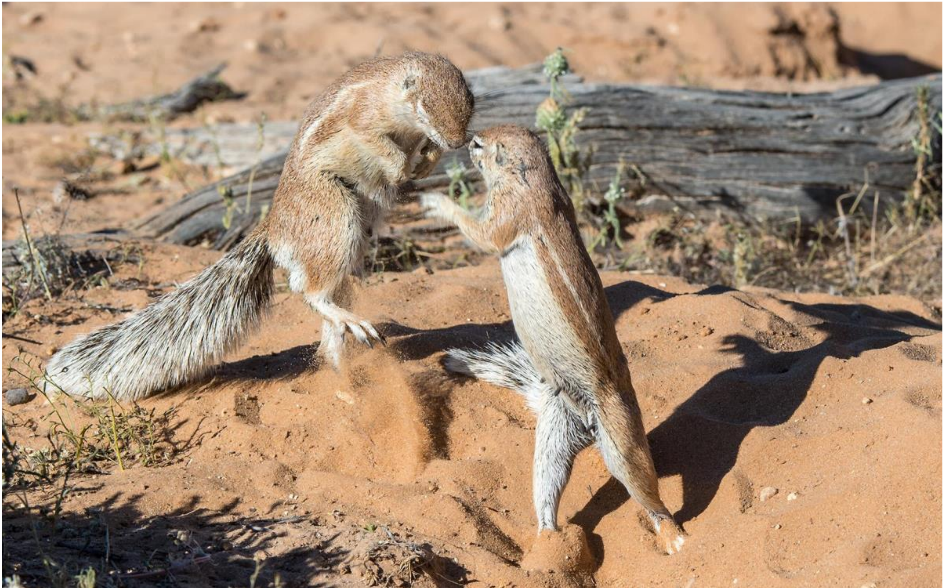
HONORABLE MENTION - GROUND SQUIRREL CONFLICT by ROY KILLEN (AUSTRALIA)