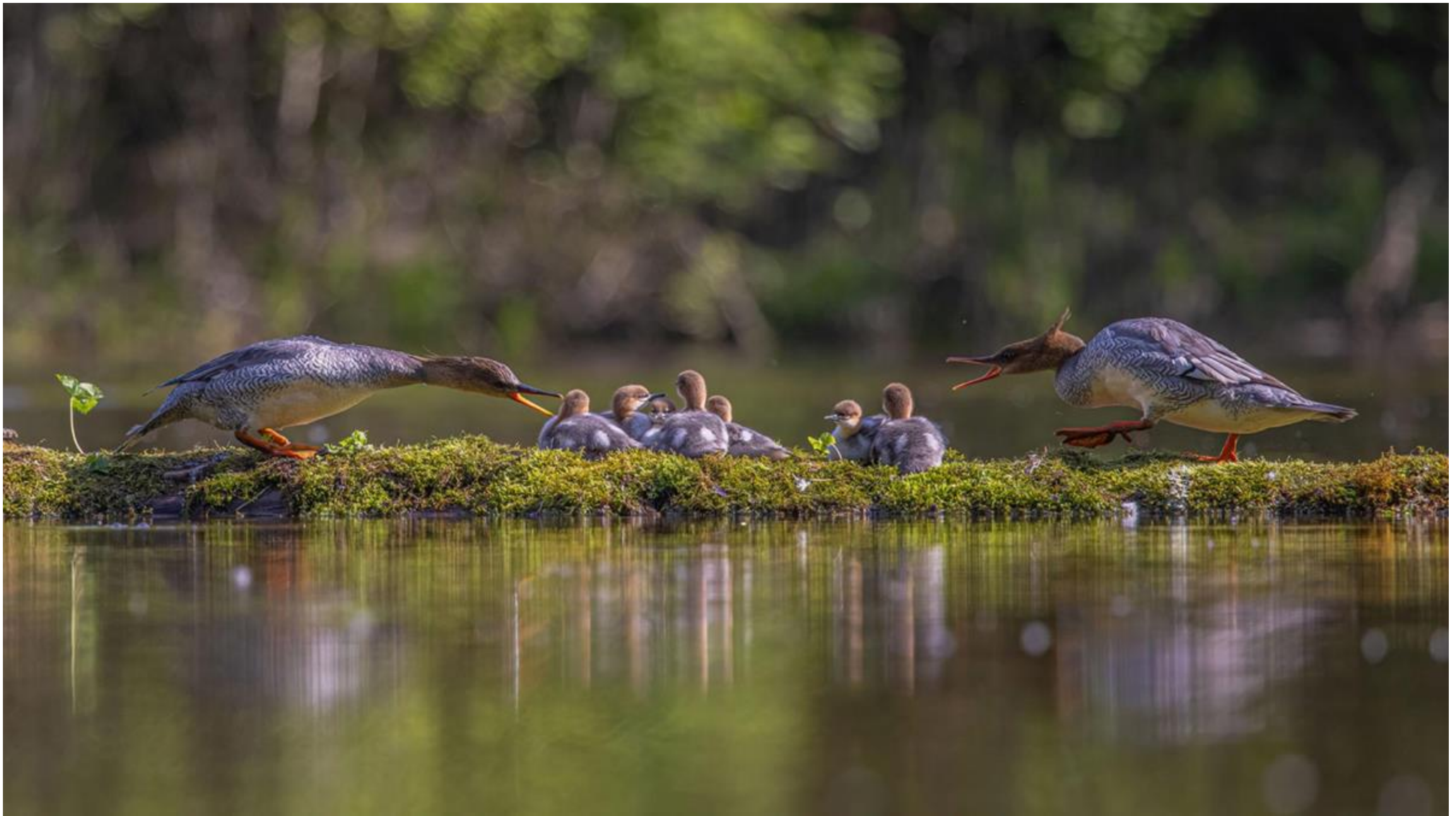
JUDGES CHOICE AWARD - WRANGLE by QINGSHUN LIU (CHINA)