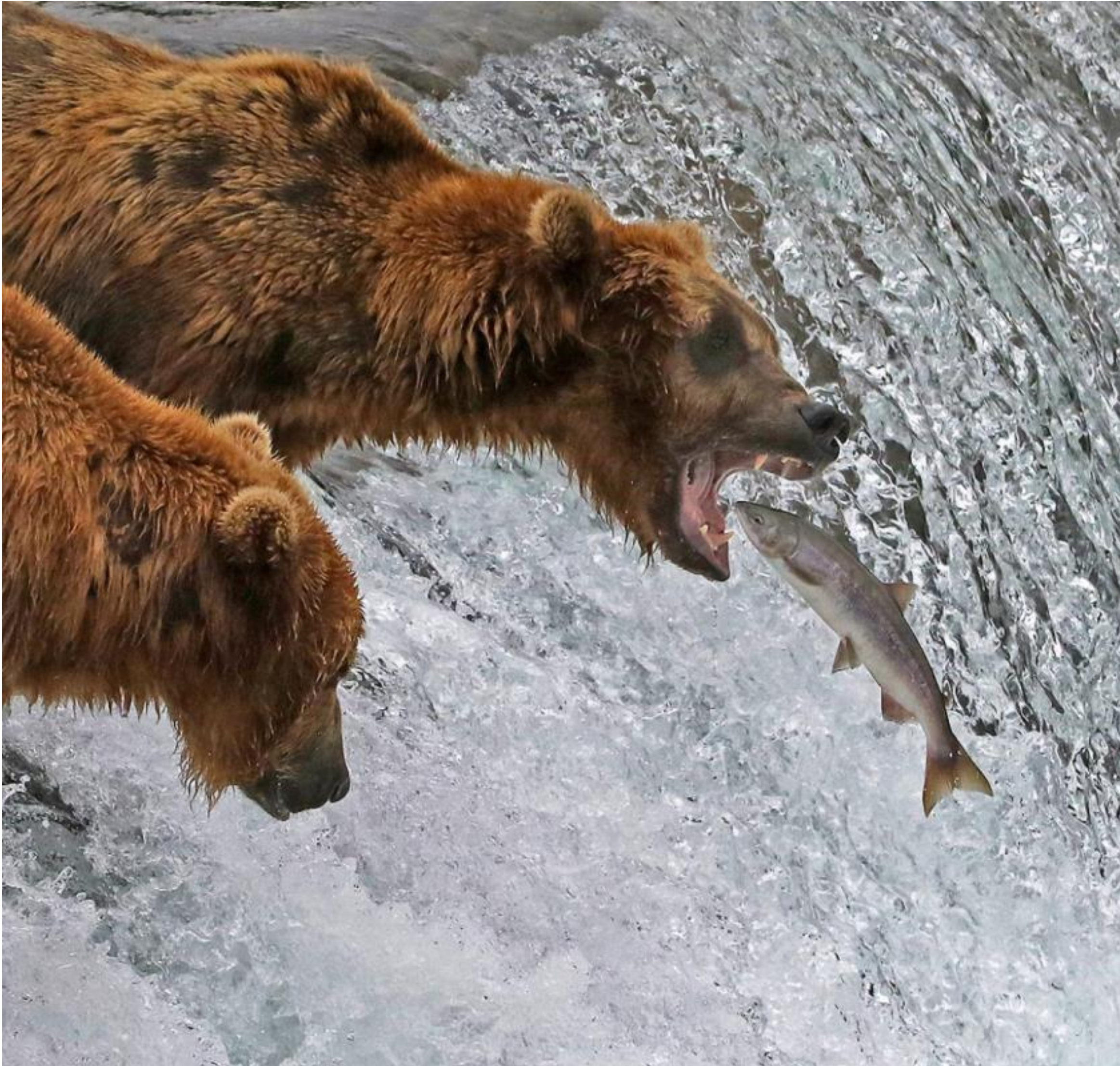
JUDGES CHOICE AWARD - SALMON JUMPS INTO BEARS MOUTH 0217 by CHARLES STRICKER (USA)