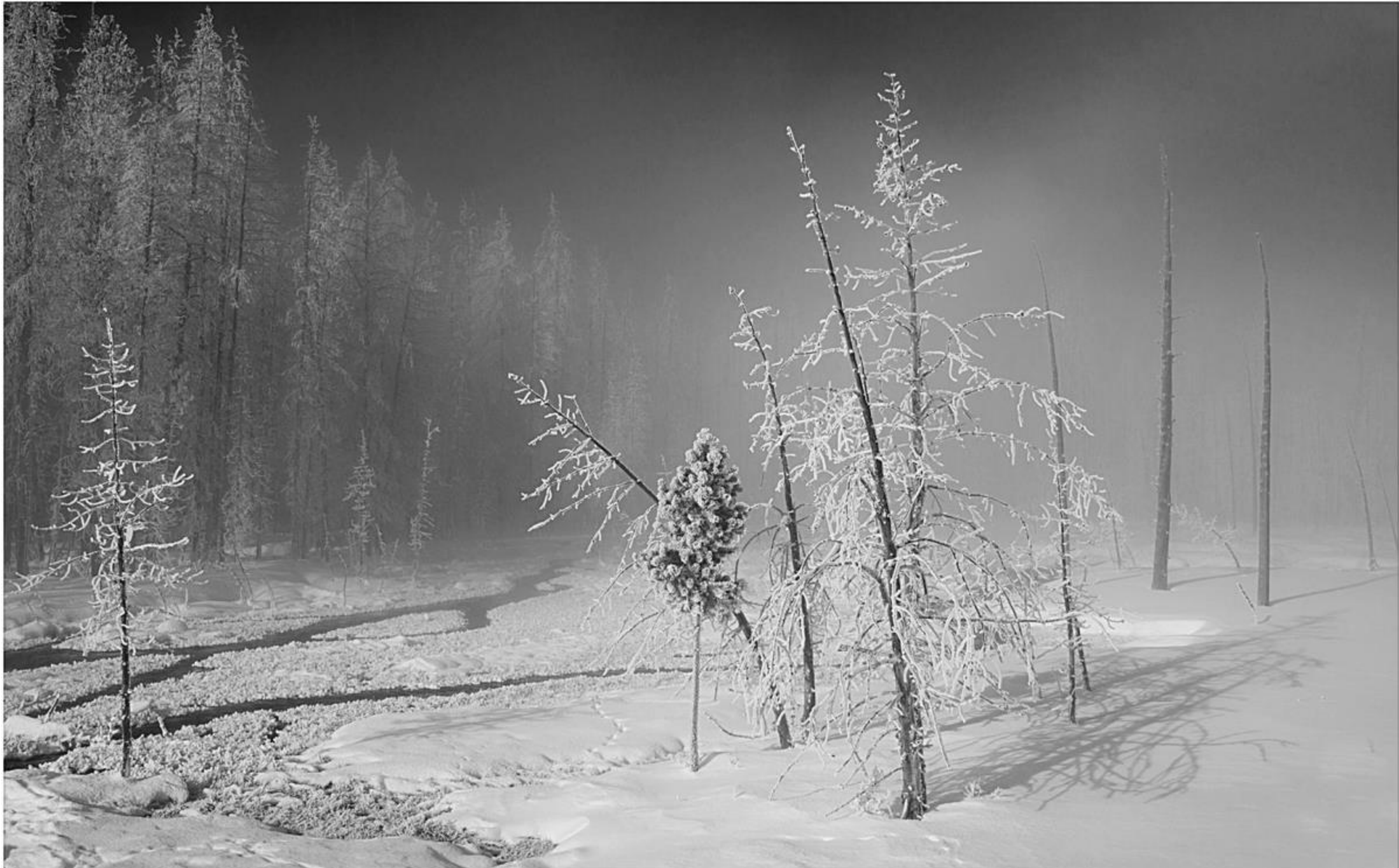
CHAIRMANS AWARD - FROZEN WOODLAND by BRIAN DAVIS (ENGLAND)