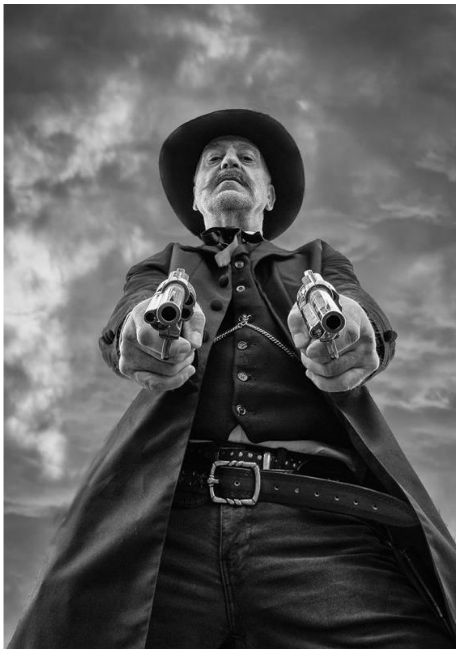
PSA SILVER - THE MARSHALL by ROBIN PRICE (ENGLAND)