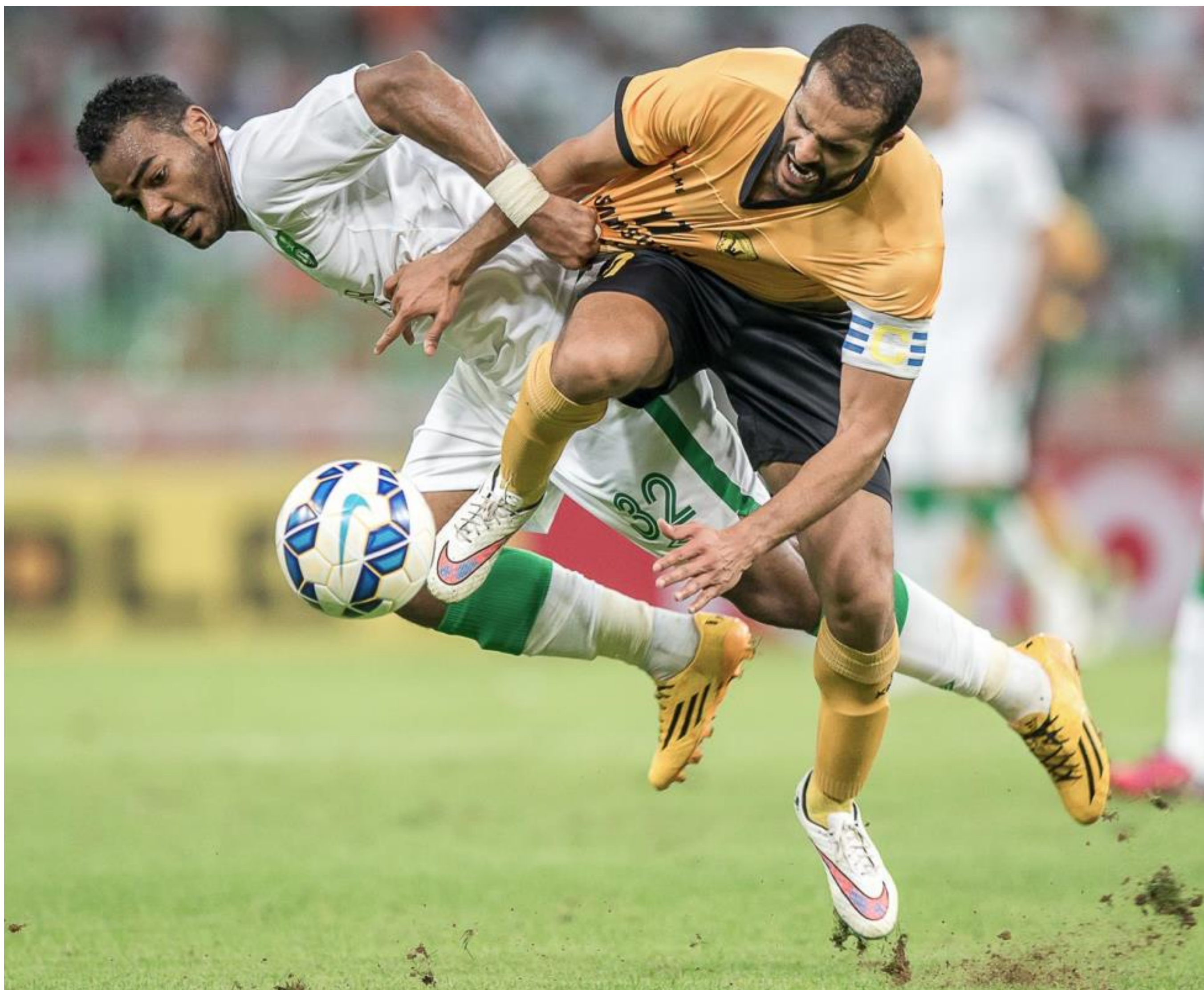
HONORABLE MENTION - TOUGHEST by FAISAL ALLOUGHANI (KUWAIT)