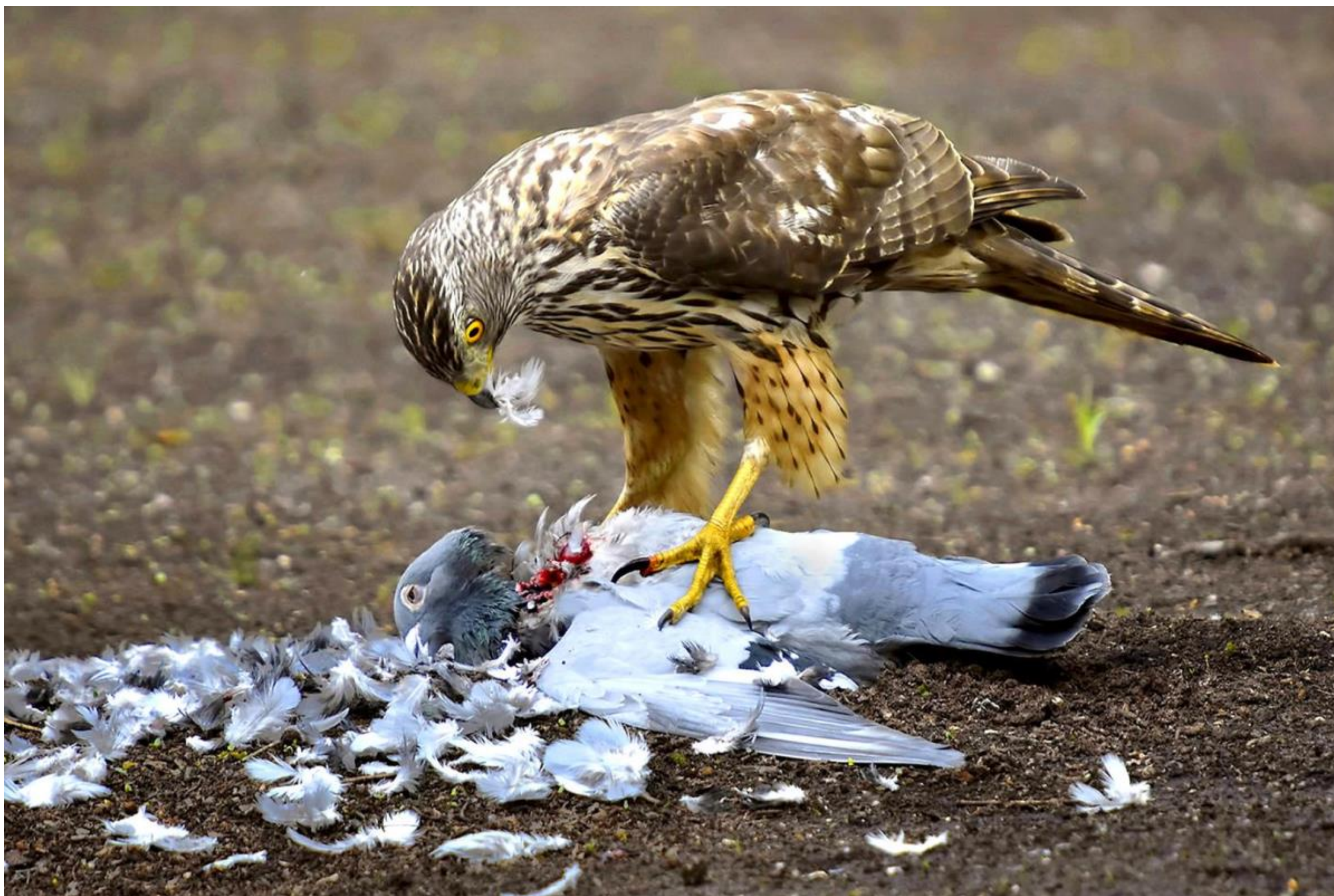
HONORABLE MENTION - EATING HAWK by RENE VAN ECHELPOEL (BELGIUM)