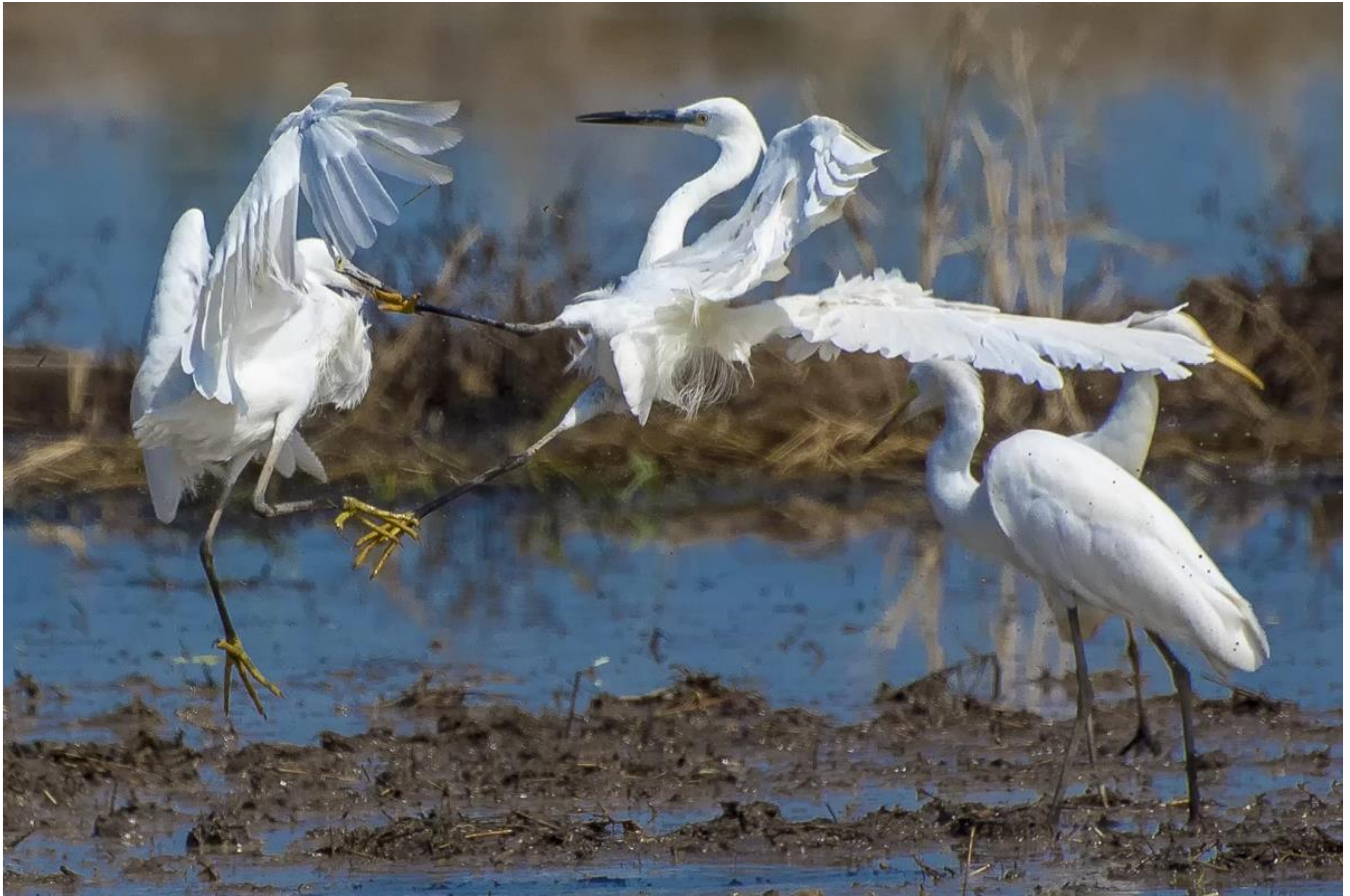
HONORABLE MENTION - FIGHT 9 by TICK NGEE LAU (MALAYSIA)