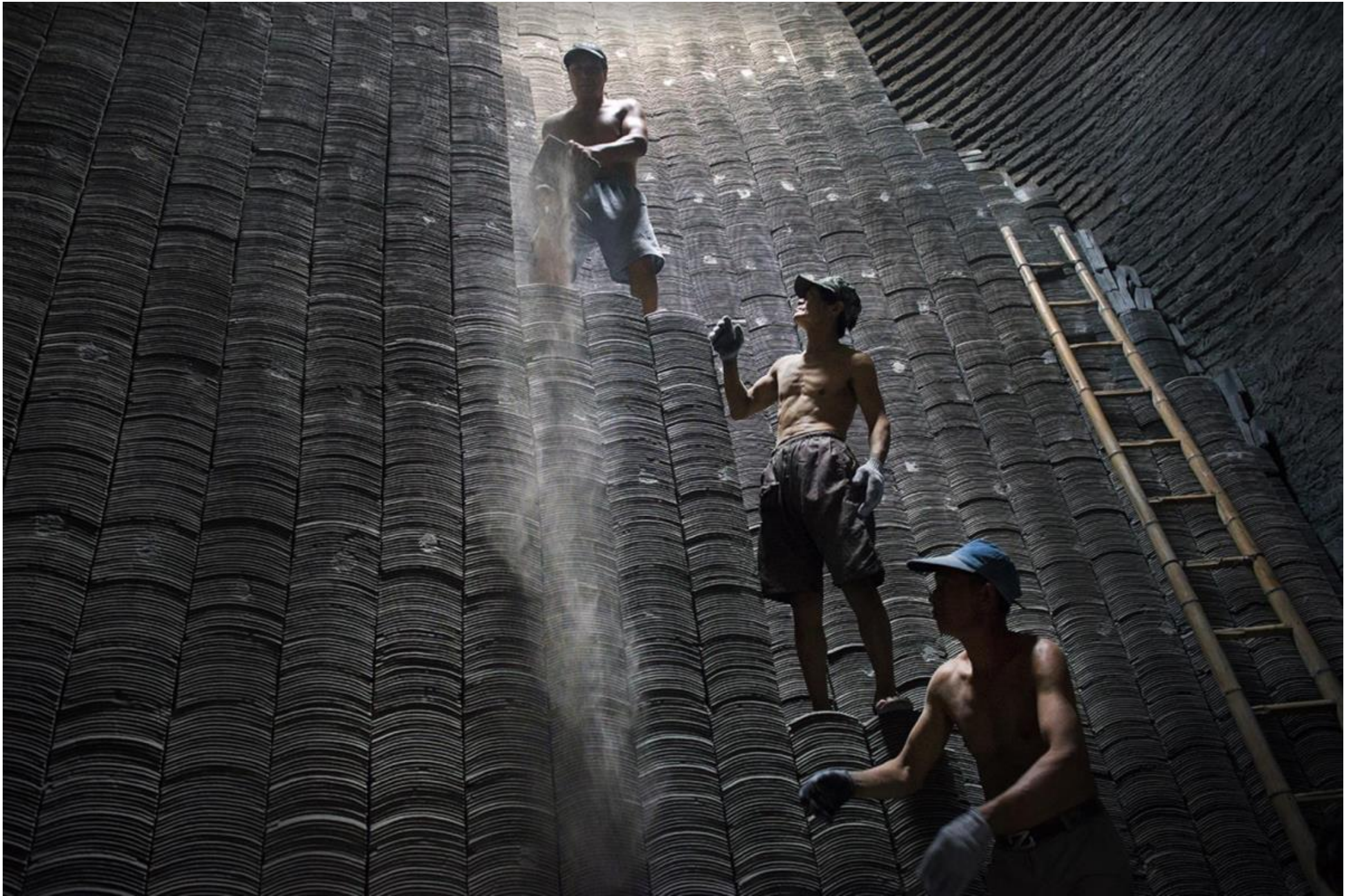
JUDGES CHOICE AWARD - KILN WORKERS 2 by JIAJUN NIU (CHINA)