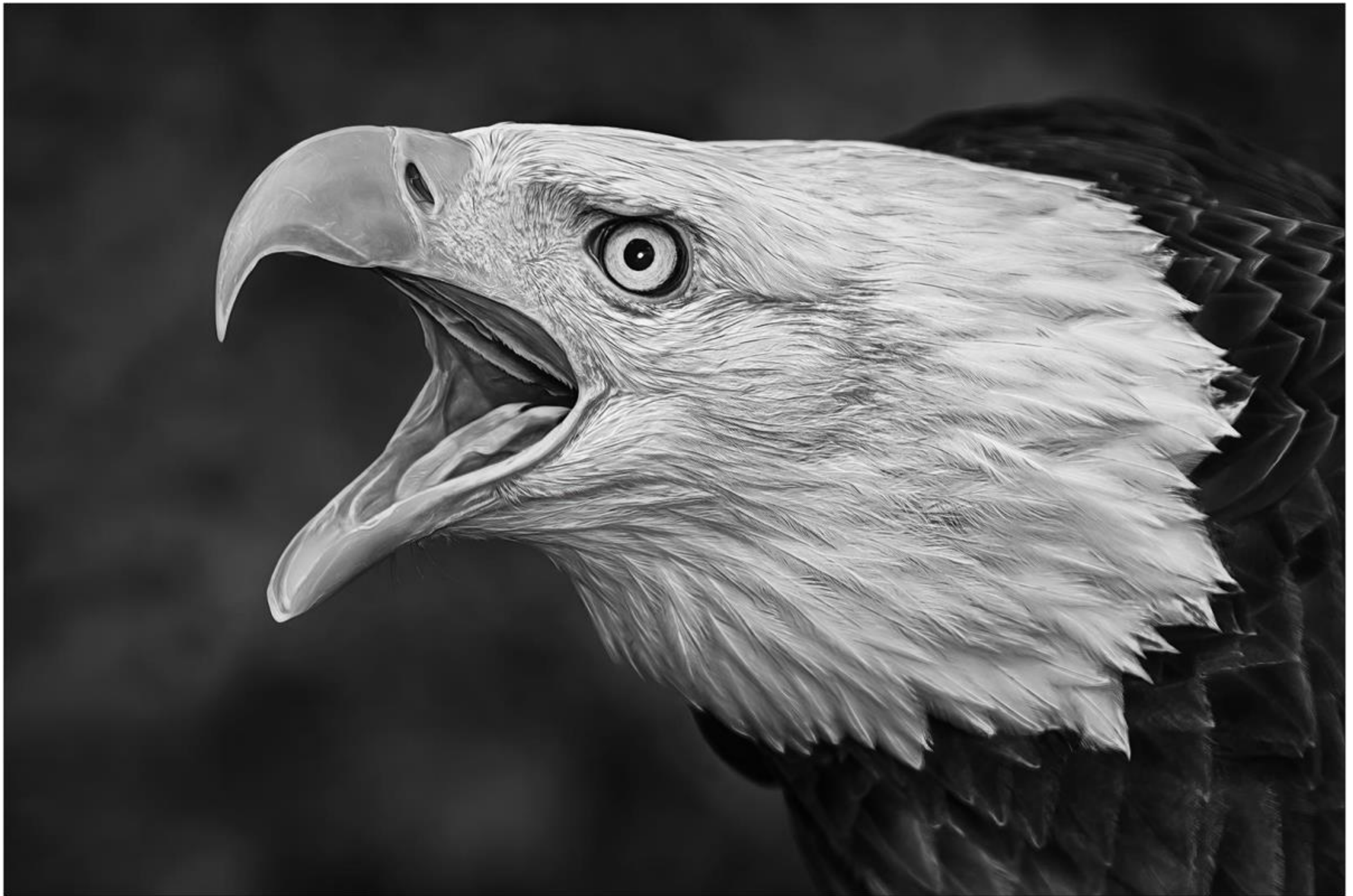
HONORABLE MENTION - SCREAMING EAGLE by DONALD DEDONATO (USA)