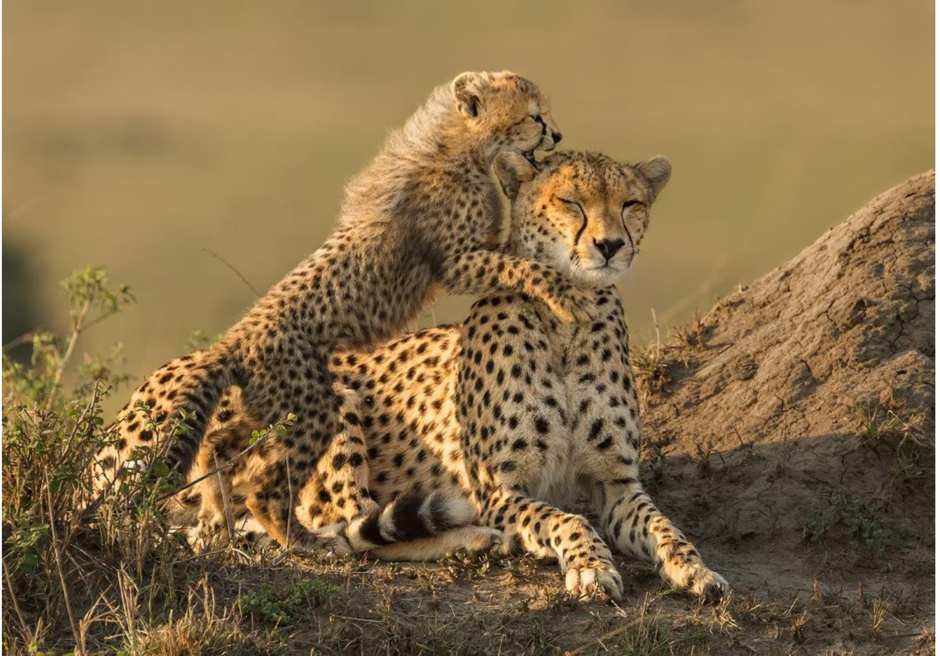
HONORABLE MENTION - CHEETAH CUB PLAYING WITH MOTHER by IAN WHISTON (ENGLAND)