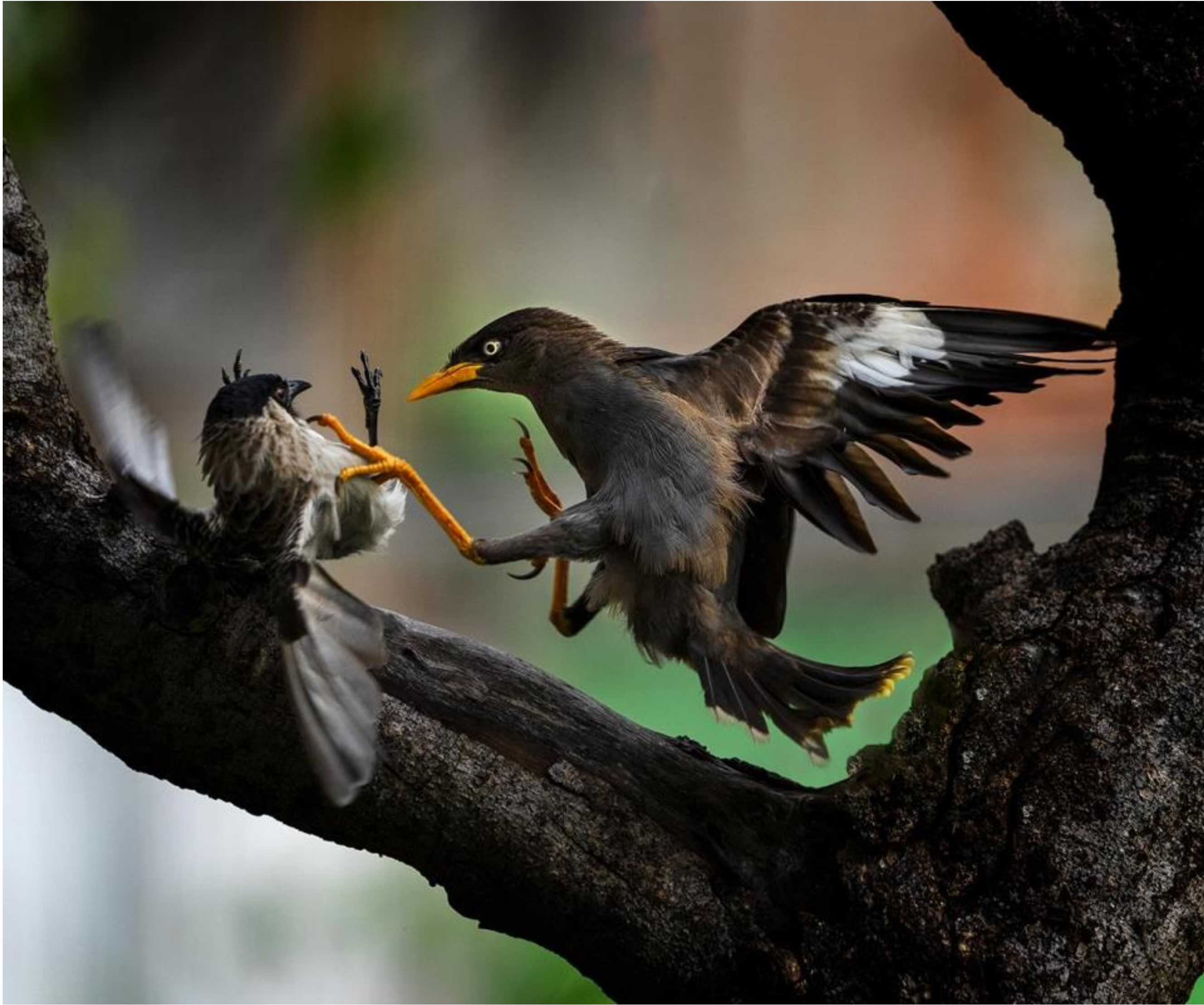
DIGITAL CHAIRMANS AWARD - FIGHTING by JANSEN HALIM (INDONESIA)