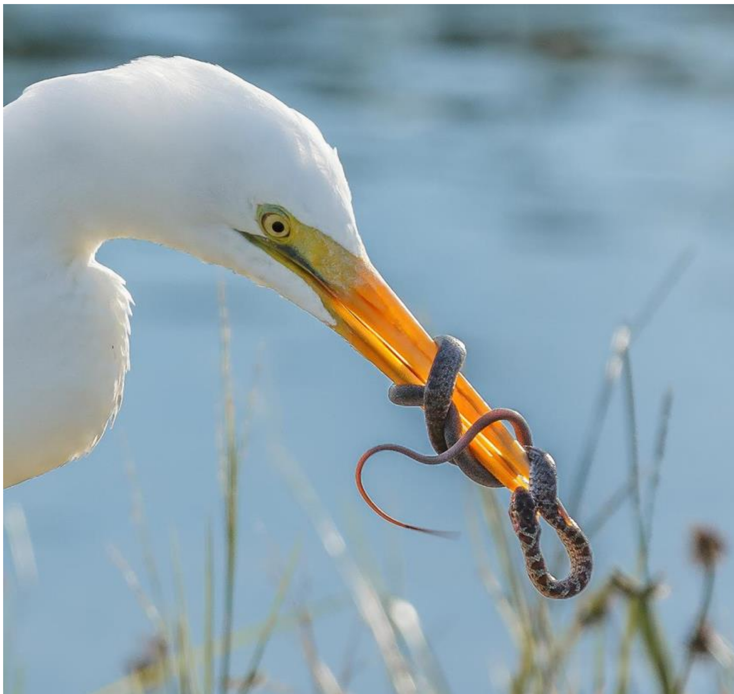
HONORABLE MENTION - GREAT EGRET WITH MILK SNAKE by RICHARD CLORAN (USA)