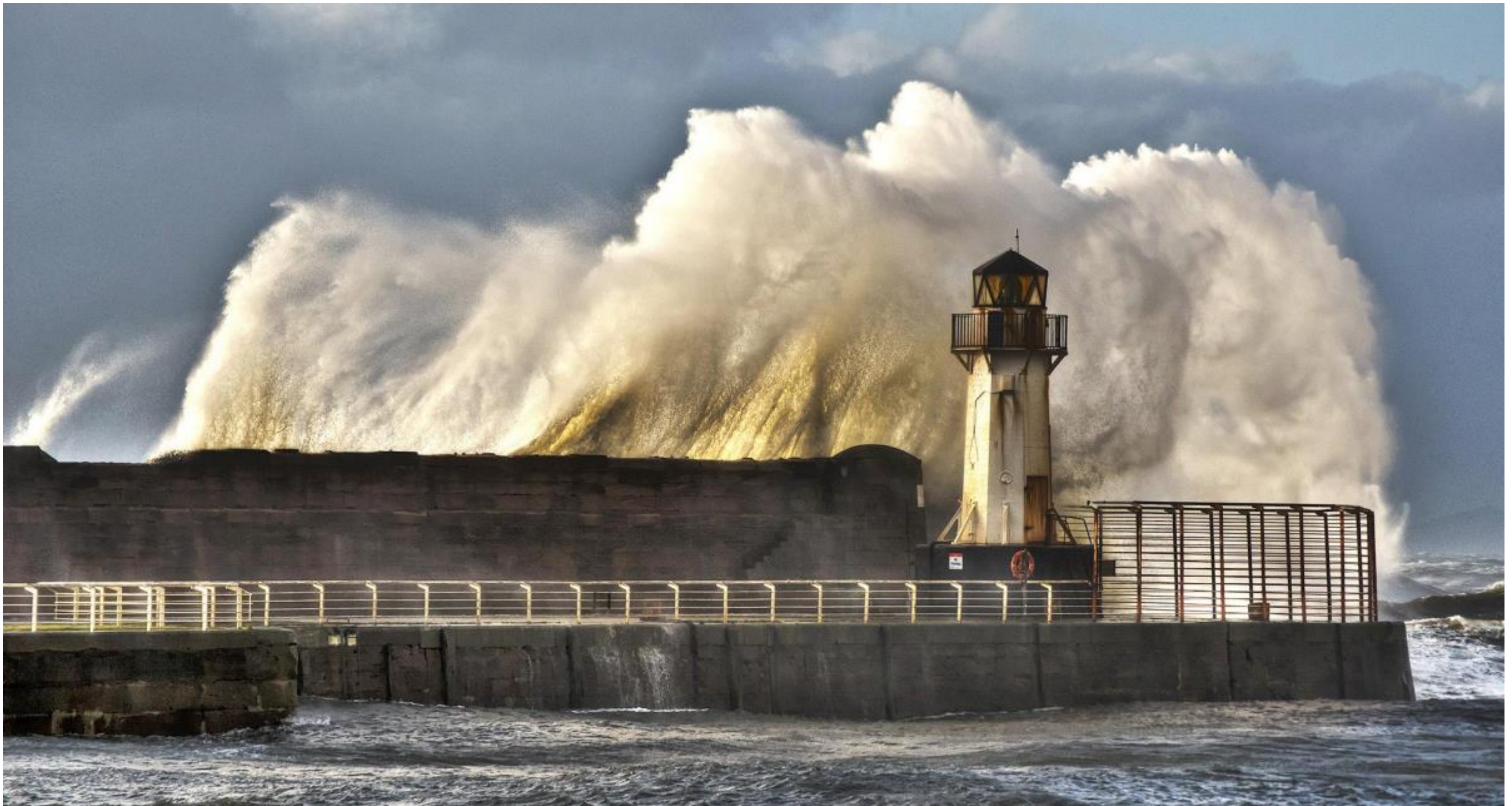
HONORABLE MENTION - STORM WAVE by ROY SMITH (SCOTLAND)