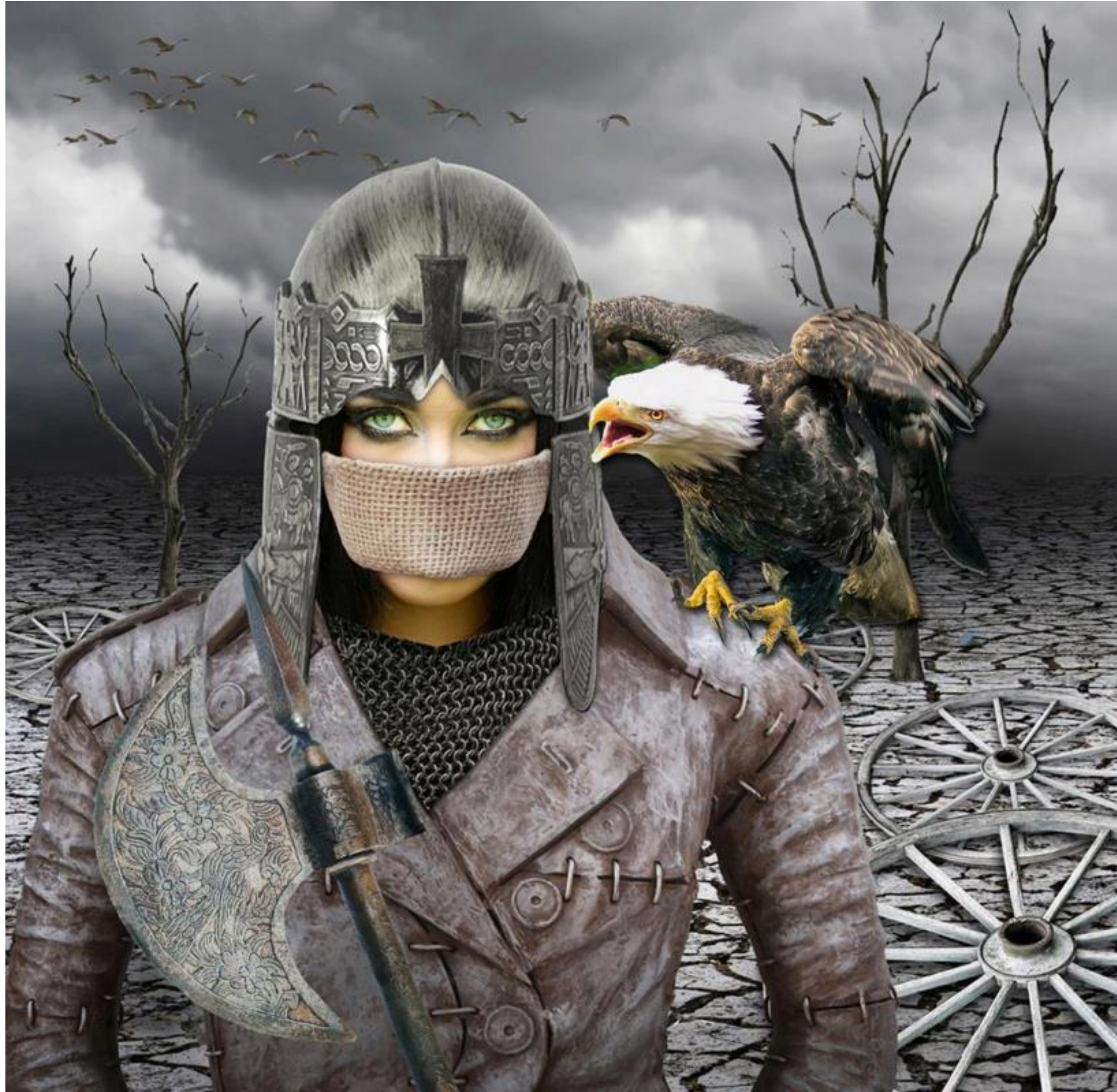
PSA GOLD - WARRIOR by FENDY P.C. YEOH (INDONESIA)