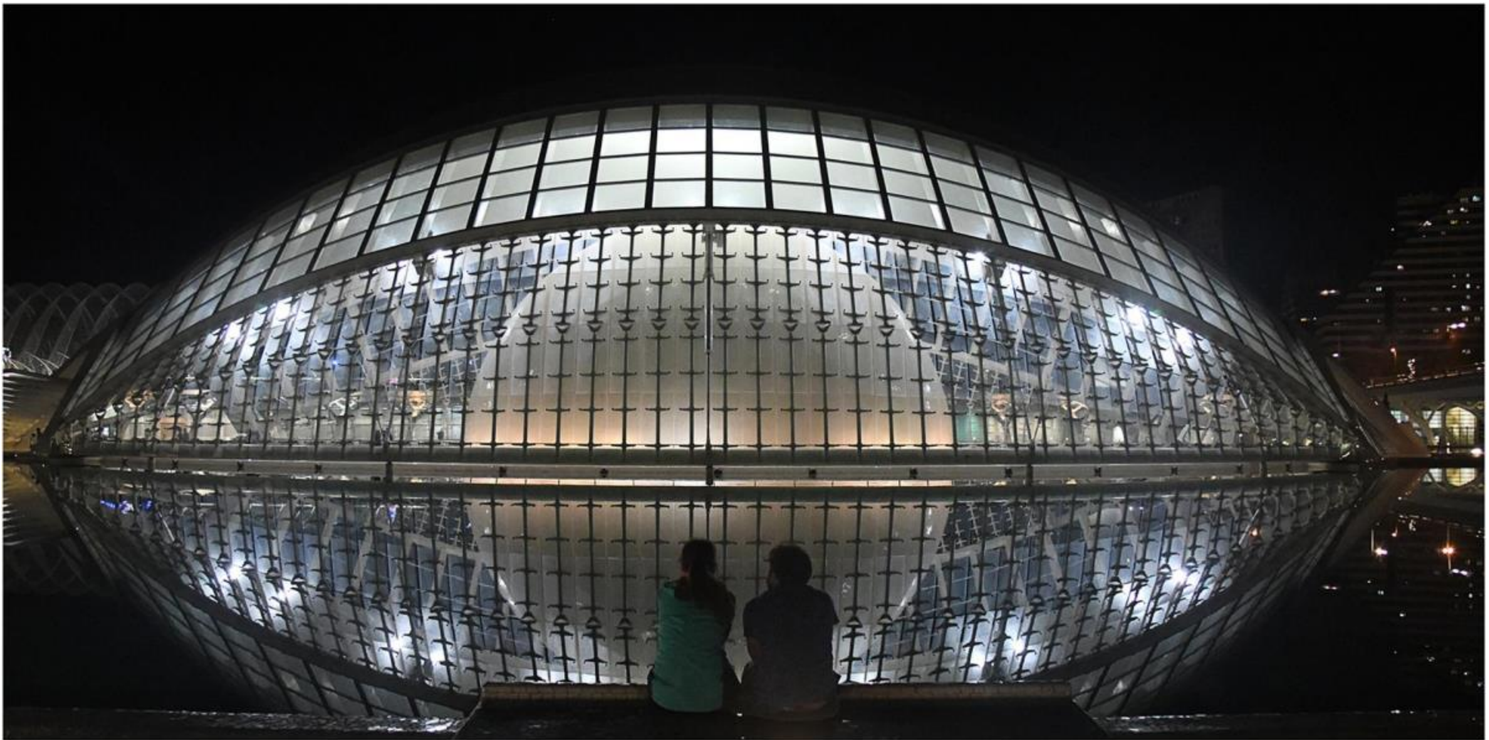
HONORABLE MENTION - WATCHING THE GLOBE by BRIAN DAVIS (ENGLAND)