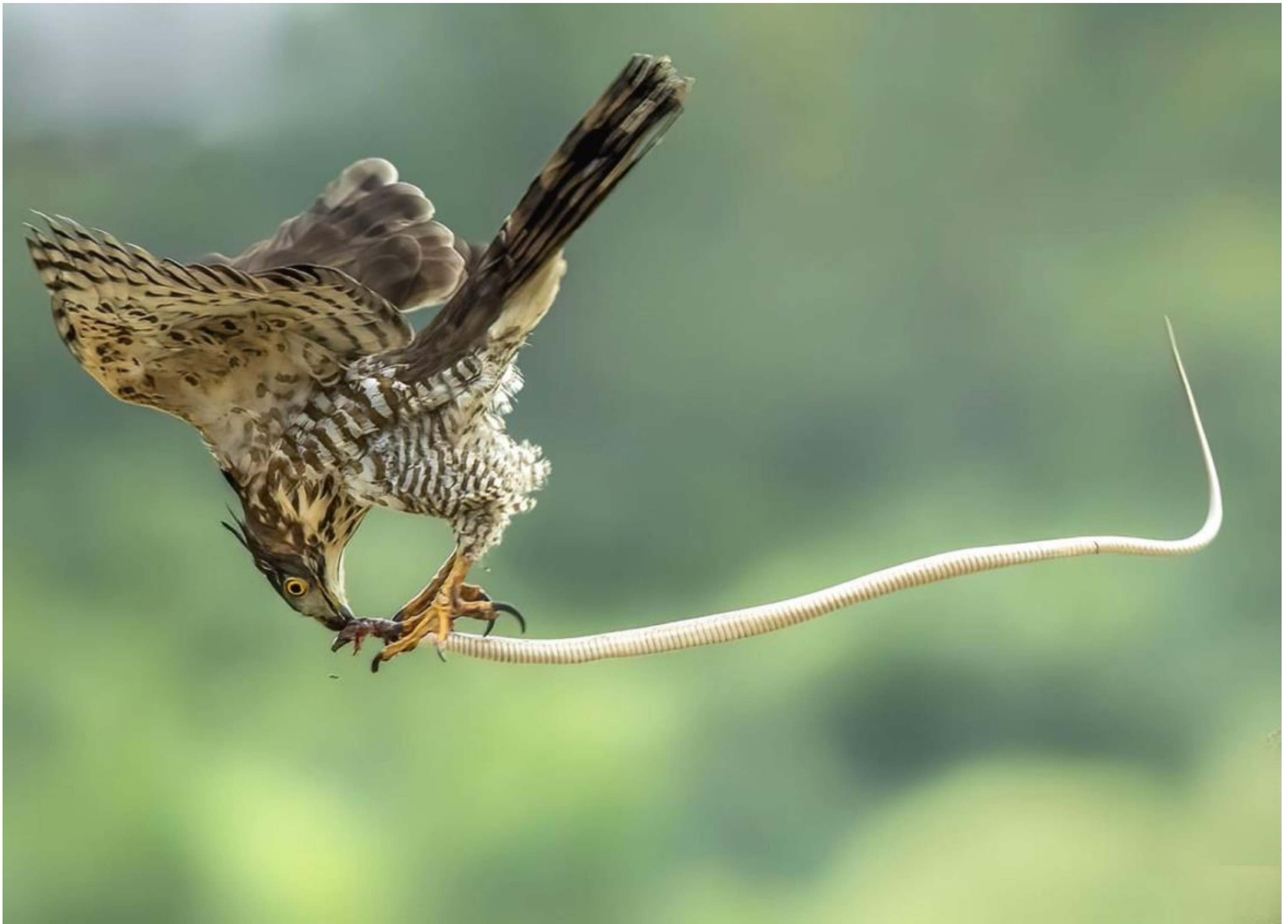
PSA SILVER - AIR DINNER by ZHIMIN ZHANG (CHINA)