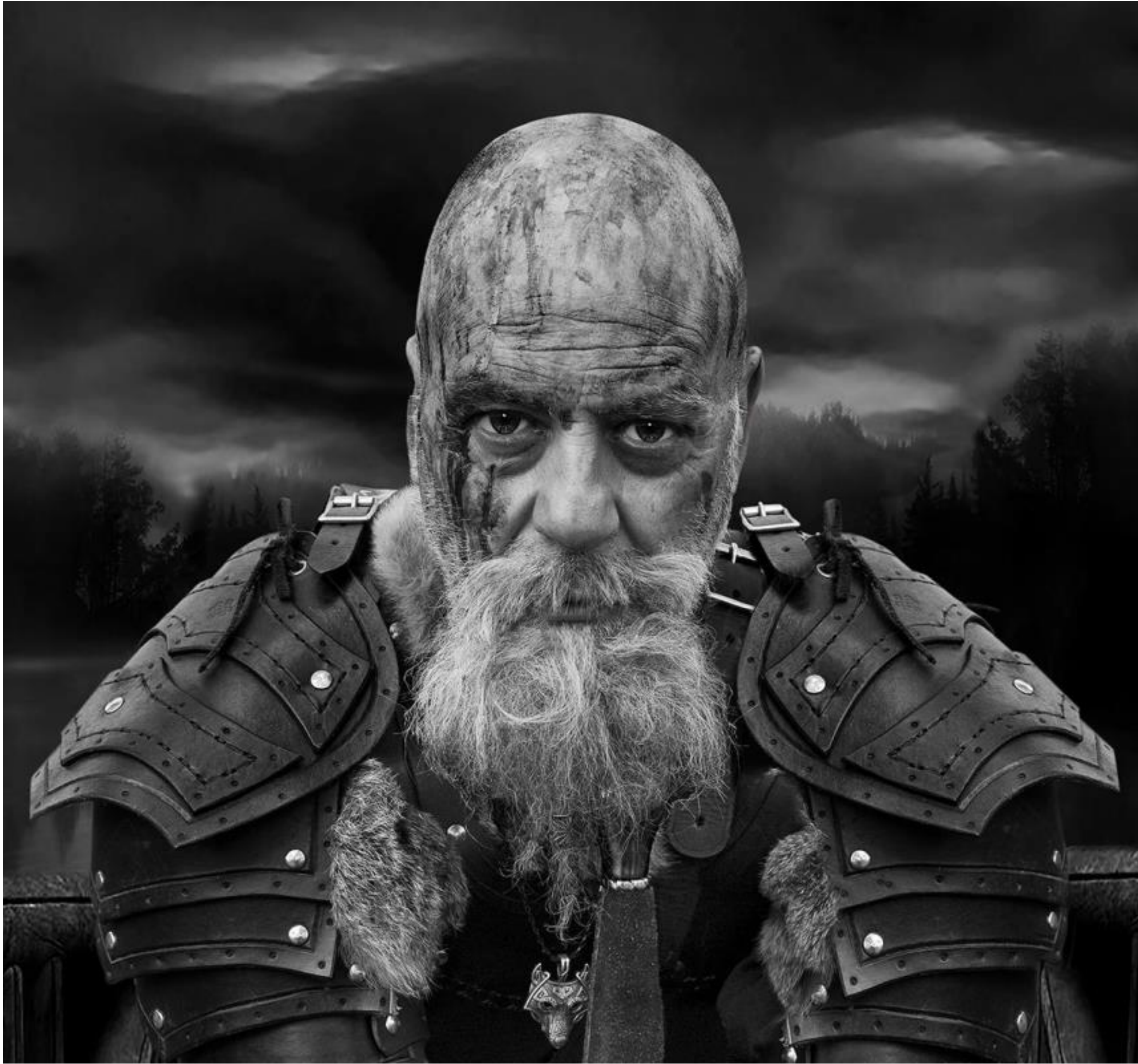
JUDGES CHOICE AWARD - BJORN by EILEEN MURRAY (ENGLAND)