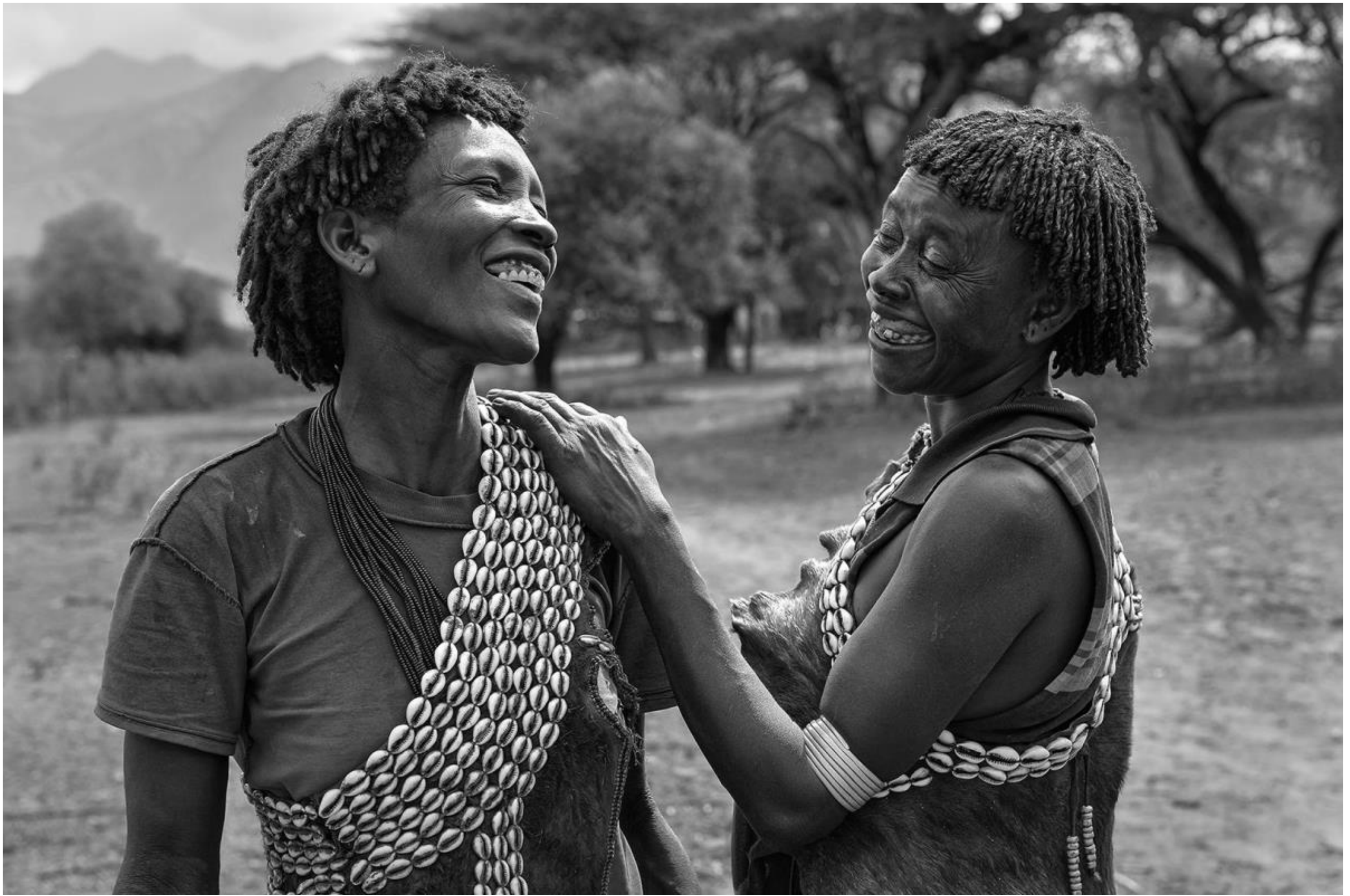
HONORABLE MENTION - BANA WOMEN by AMANI ALQAHTANI (SAUDI ARABIA)