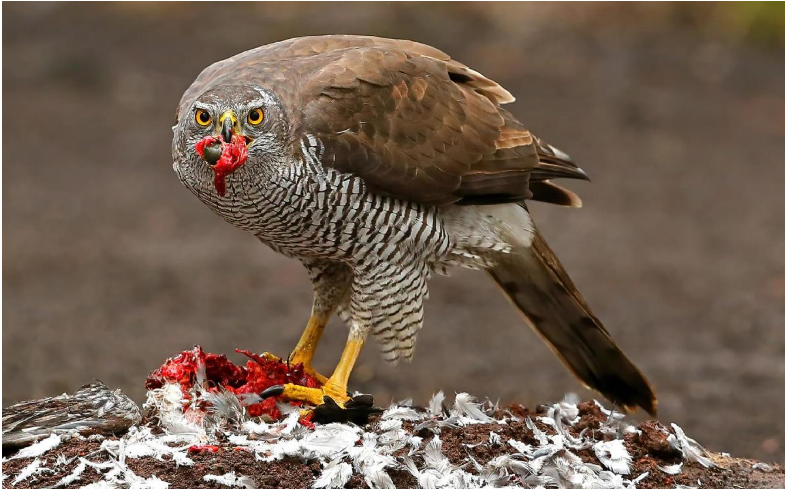
PSA GOLD - EYE CONTACT by DRE VAN MENSEL (BELGIUM)