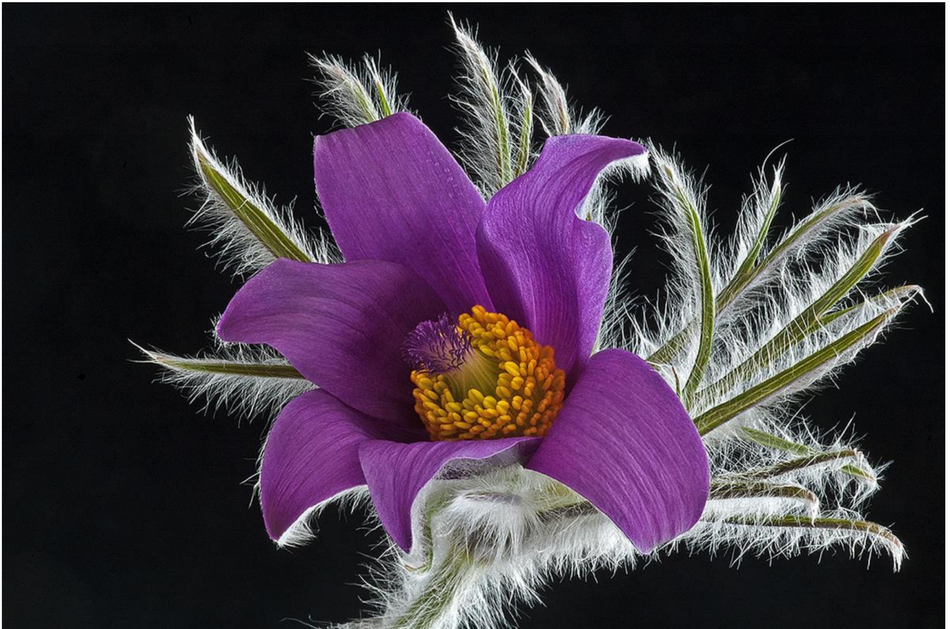
PSA BRONZE - PULSATILLA by ROY SMITH (SCOTLAND)