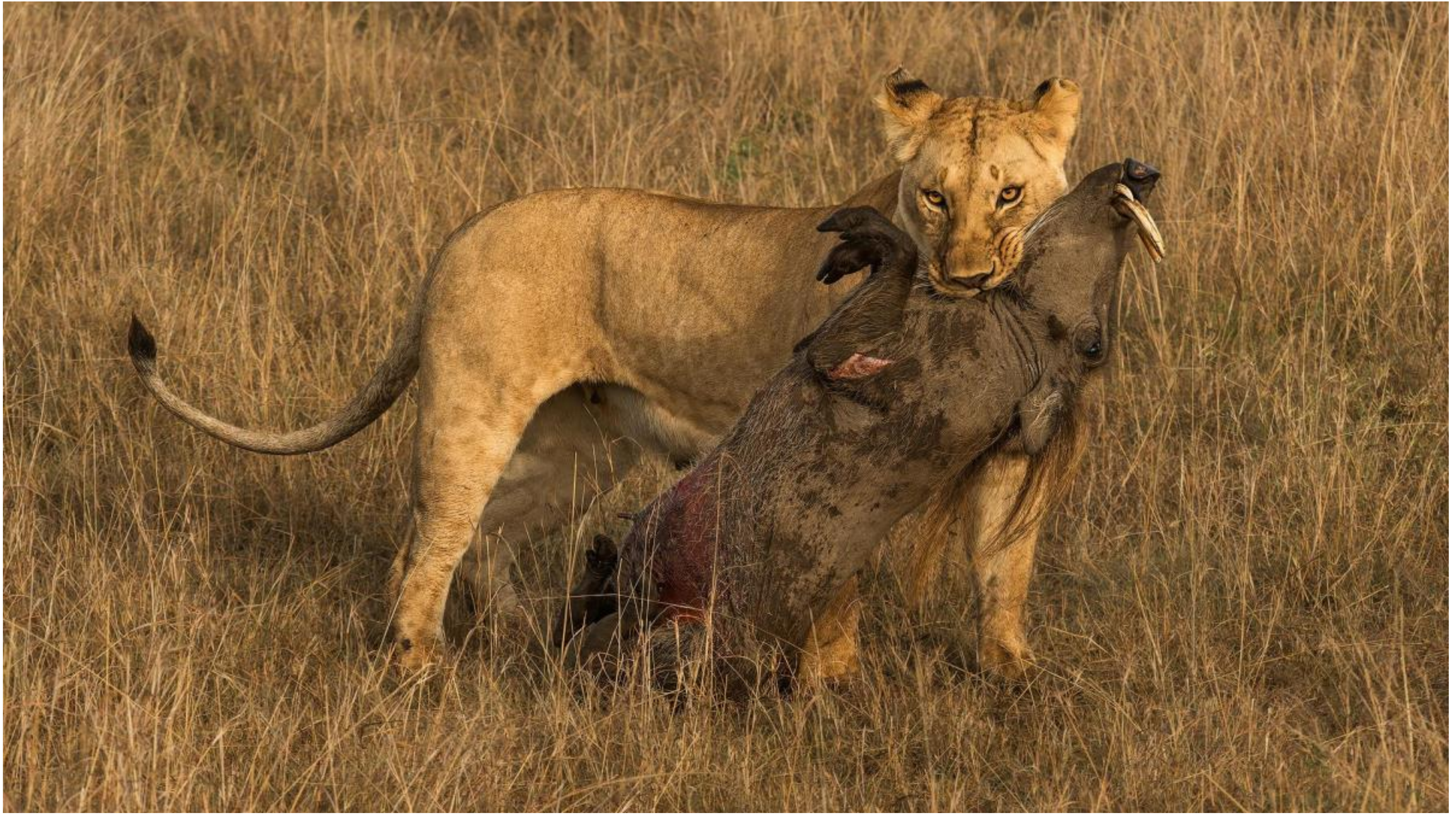
PSA SILVER - WARTHOG DEMISE by IAN WHISTON (ENGLAND)