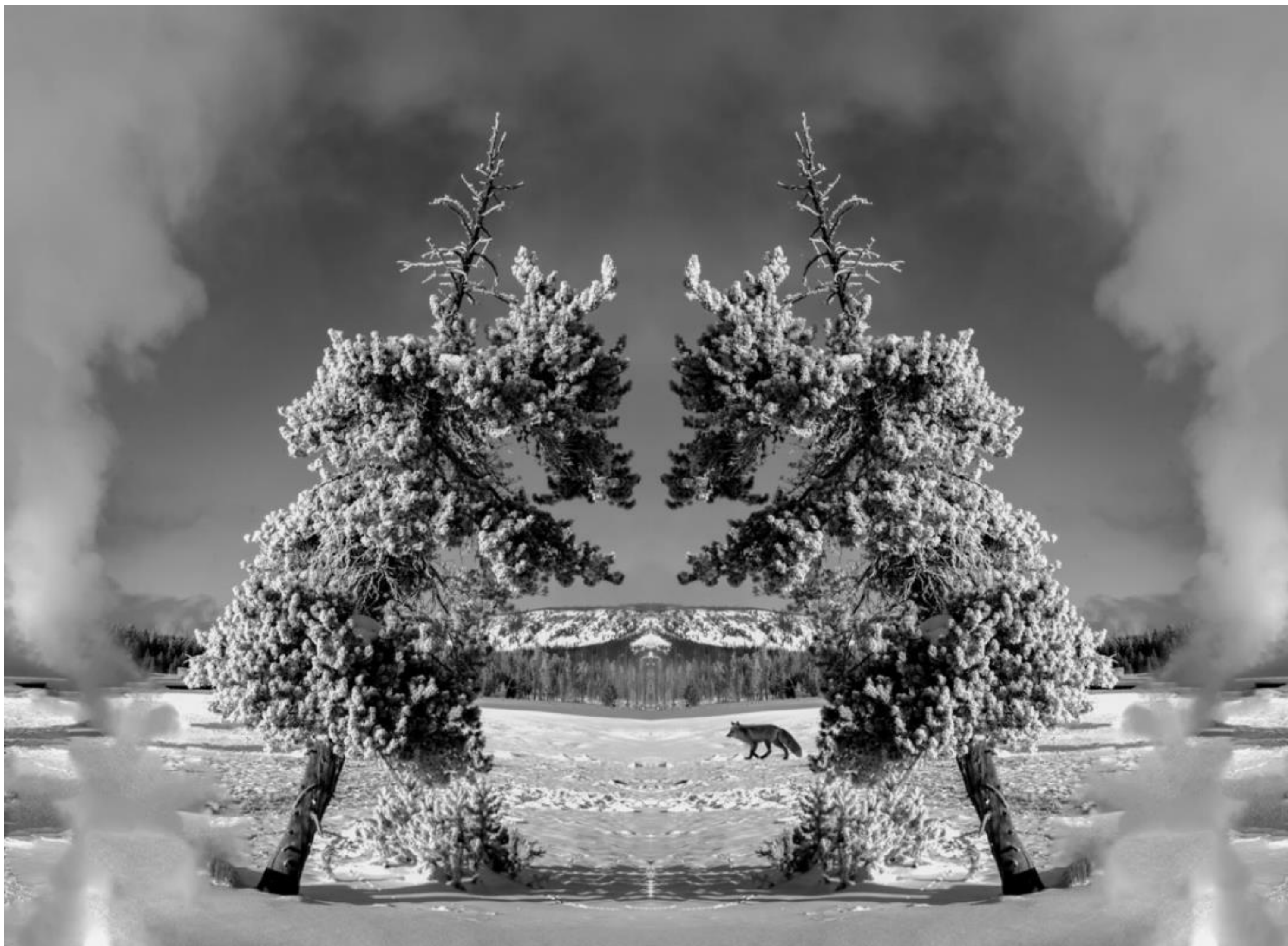
HONORABLE MENTION - YELLOWSTONE FOX MONO by CHARLIE WILLARD (USA)