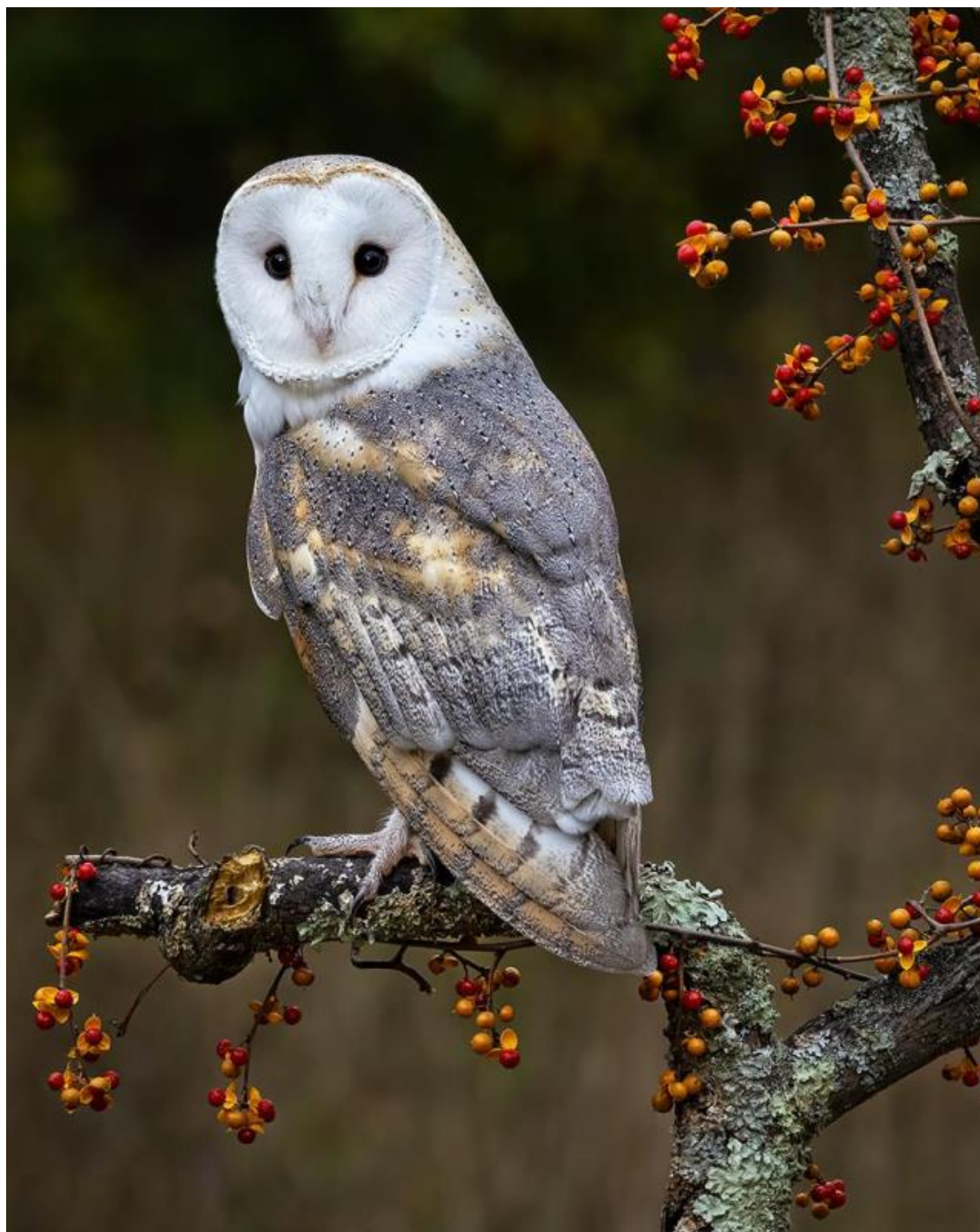
JUDGES CHOICE AWARD - PENSIVE EUROPEAN BARN OWL by DONALD DEDONATO (USA)