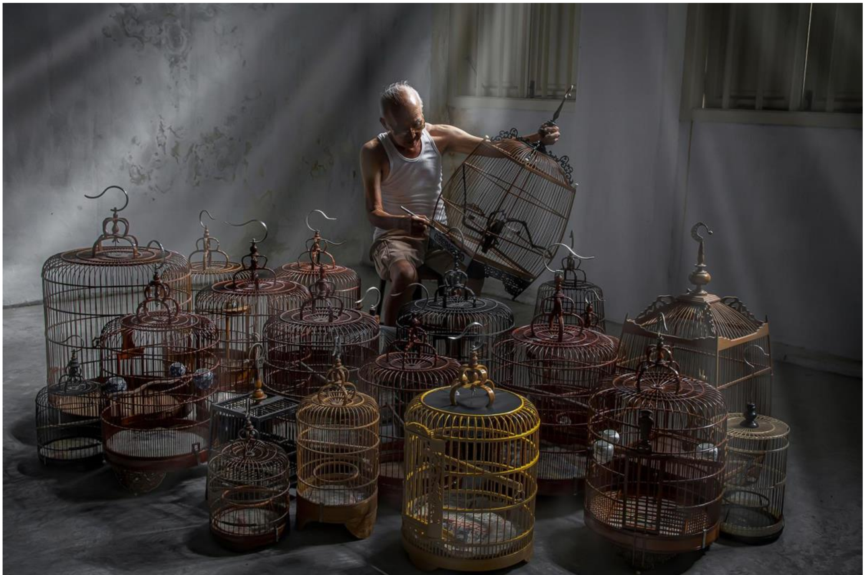
CHAIRMANS AWARD - MASTER BIRDCAGE 2 by WEE HUEI KOH (MALAYSIA)