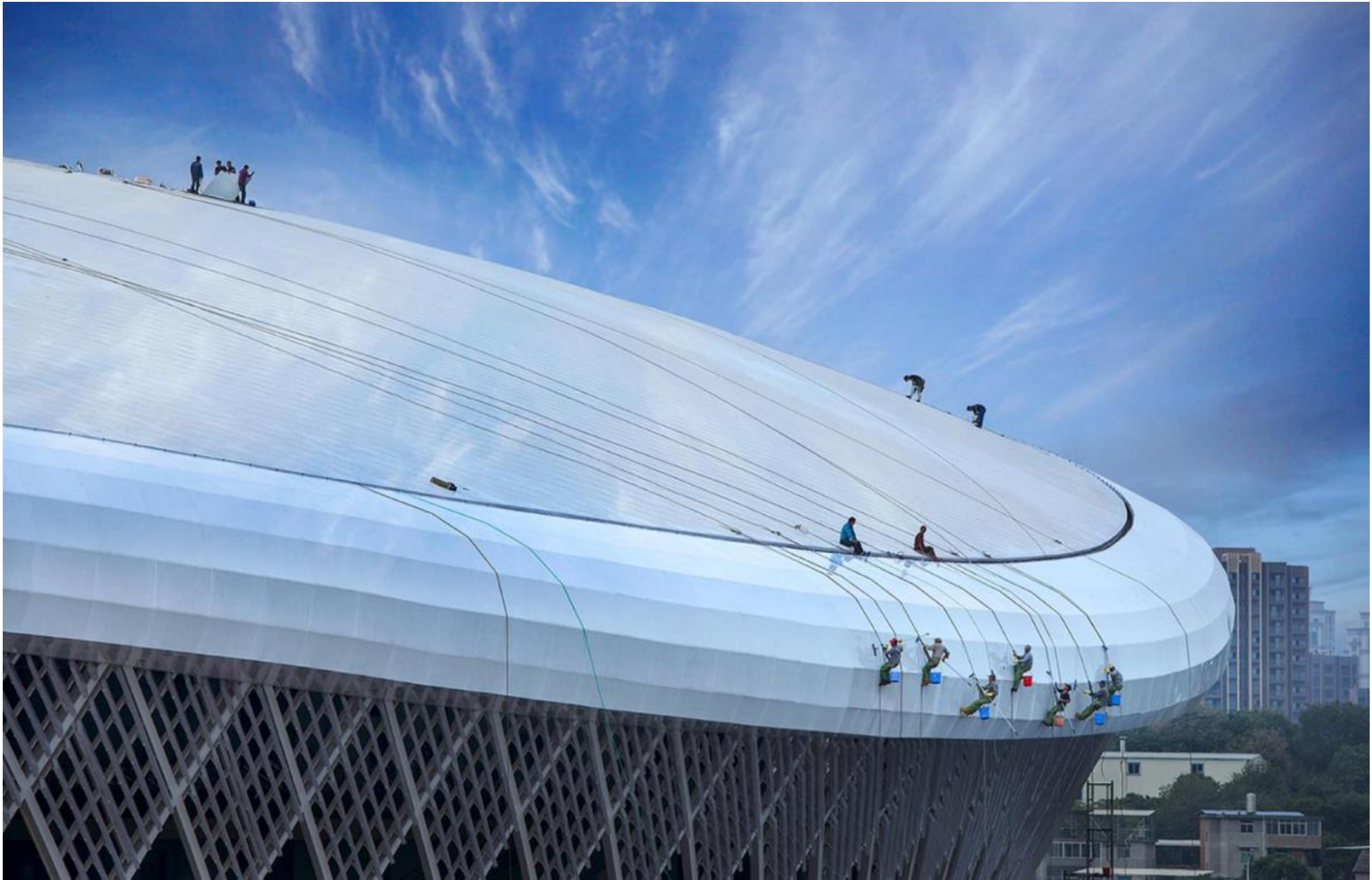
HONORABLE MENTION - SPIDERMAN 8 by JIAJUN NIU (CHINA)