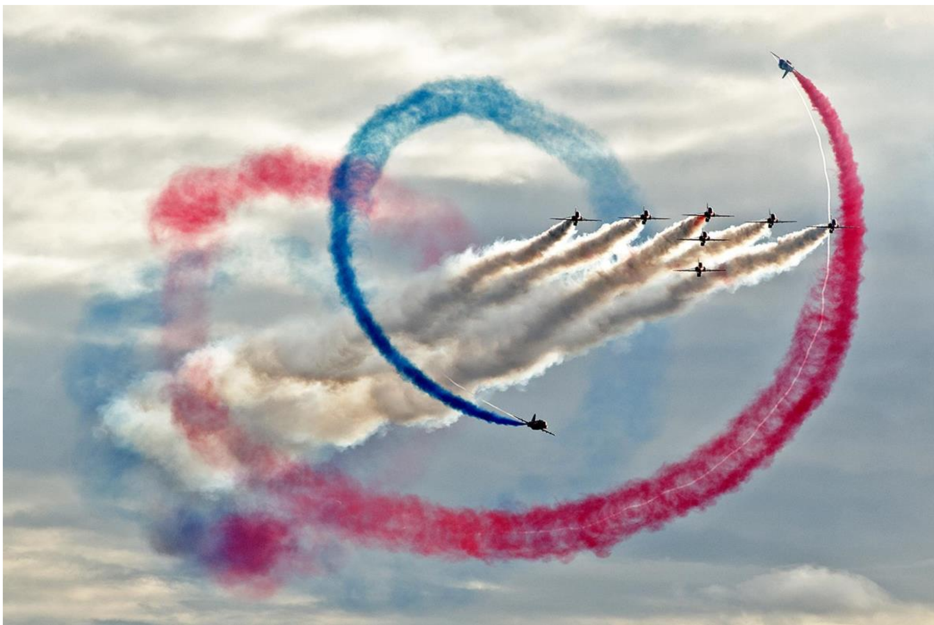
PSA BRONZE - RED ARROWS, TORNADO by ROY SMITH (SCOTLAND)