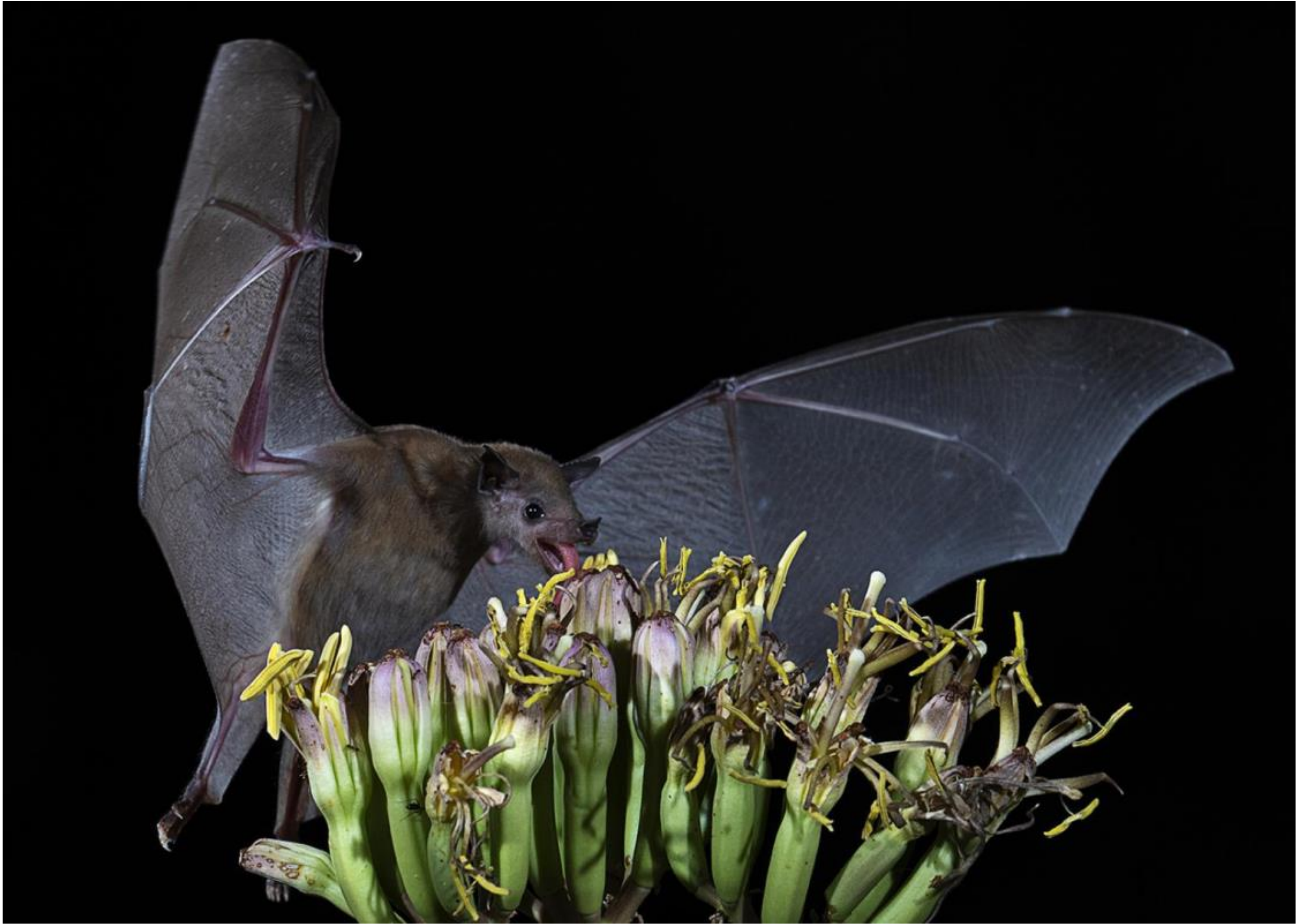
HONORABLE MENTION - NECTAR BAT ON AGAVE FLOWER 05 by LILLIAN ROBERTS (USA)