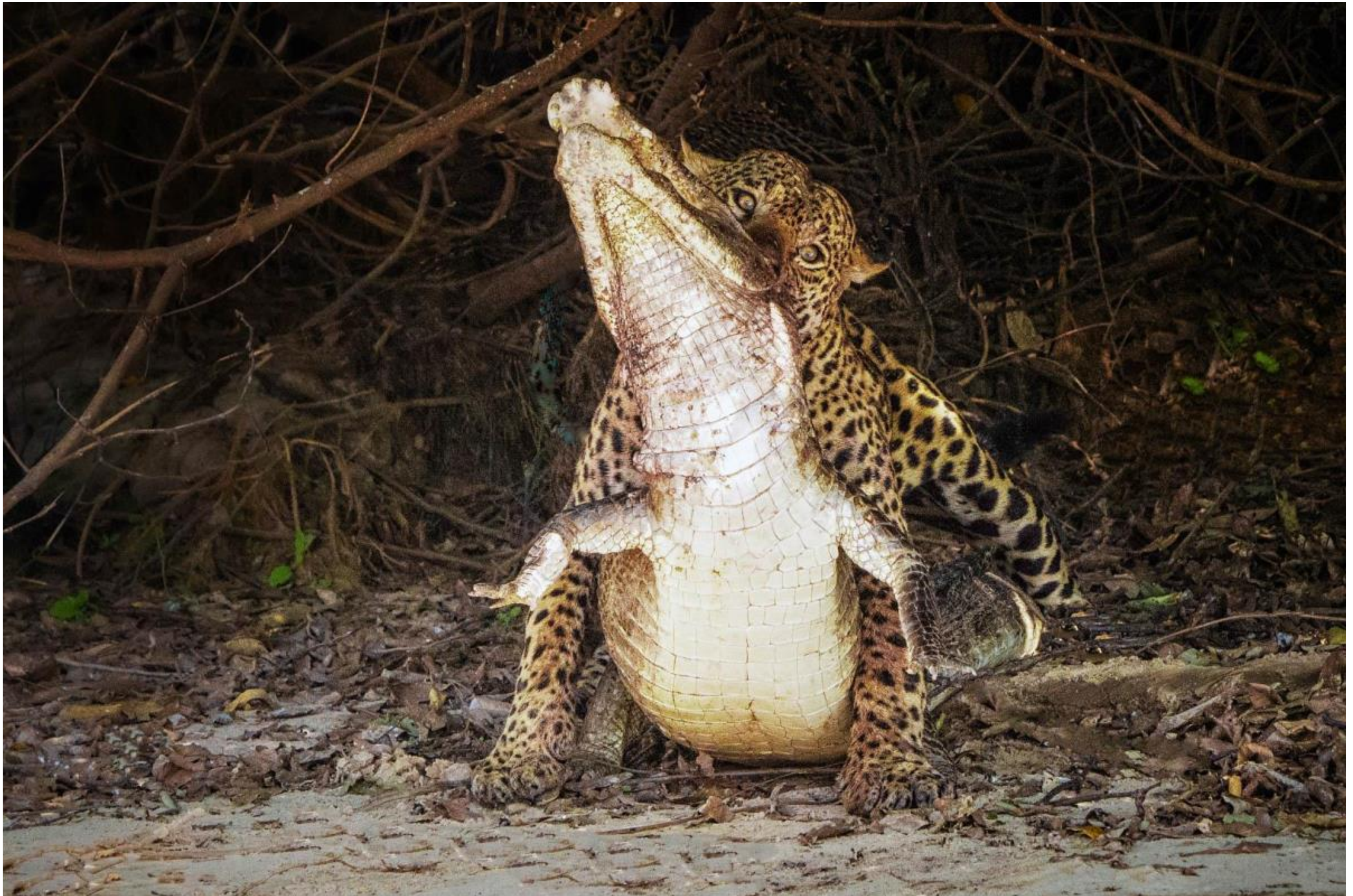
CHAIRMANS AWARD - JAGUAR KILL PSA MASTER 9-2-21-1 by LARRY MIYAMURA (USA)