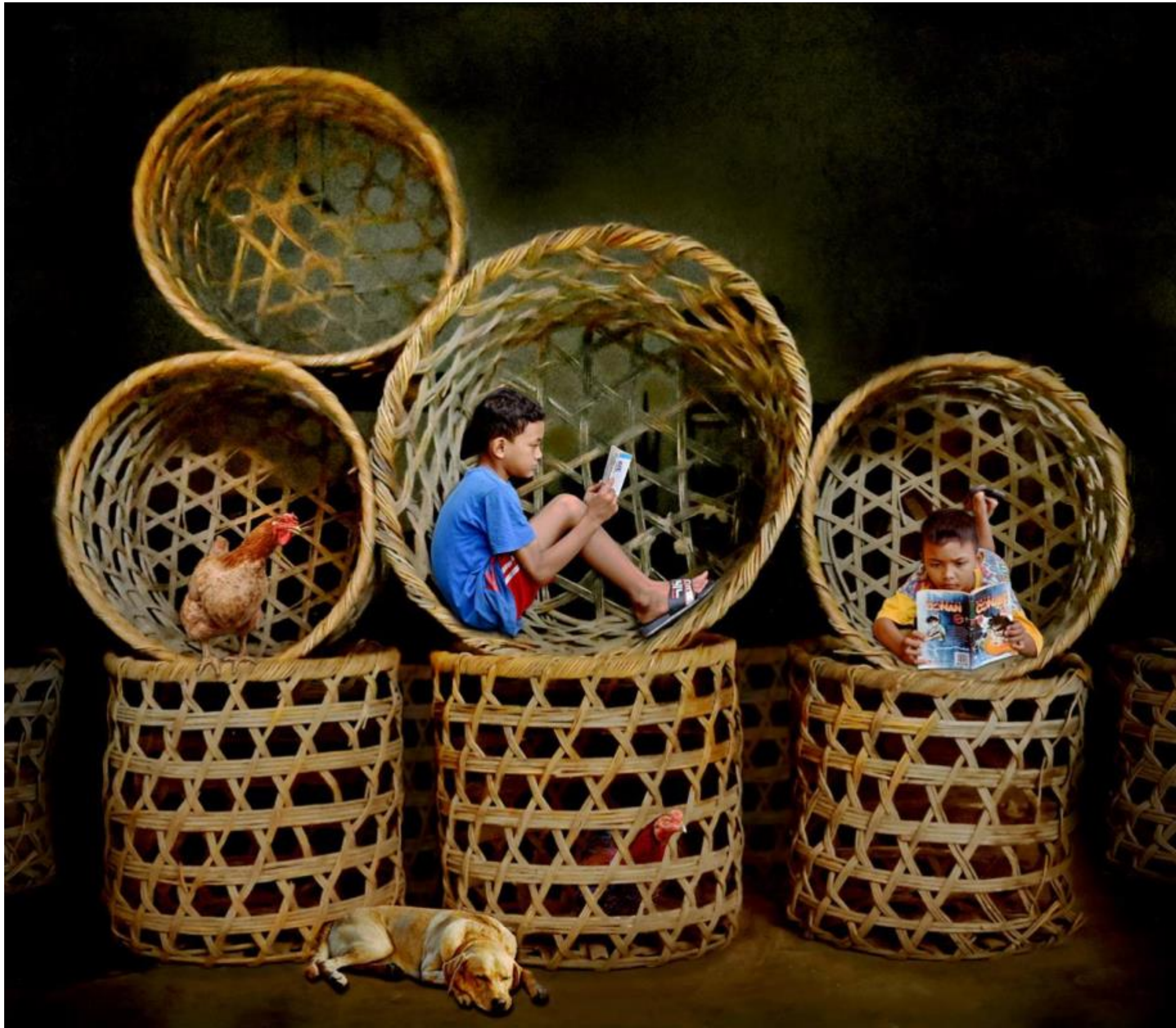
JUDGES CHOICE AWARD - LEISURE READING by FENDY P.C. YEOH (INDONESIA)