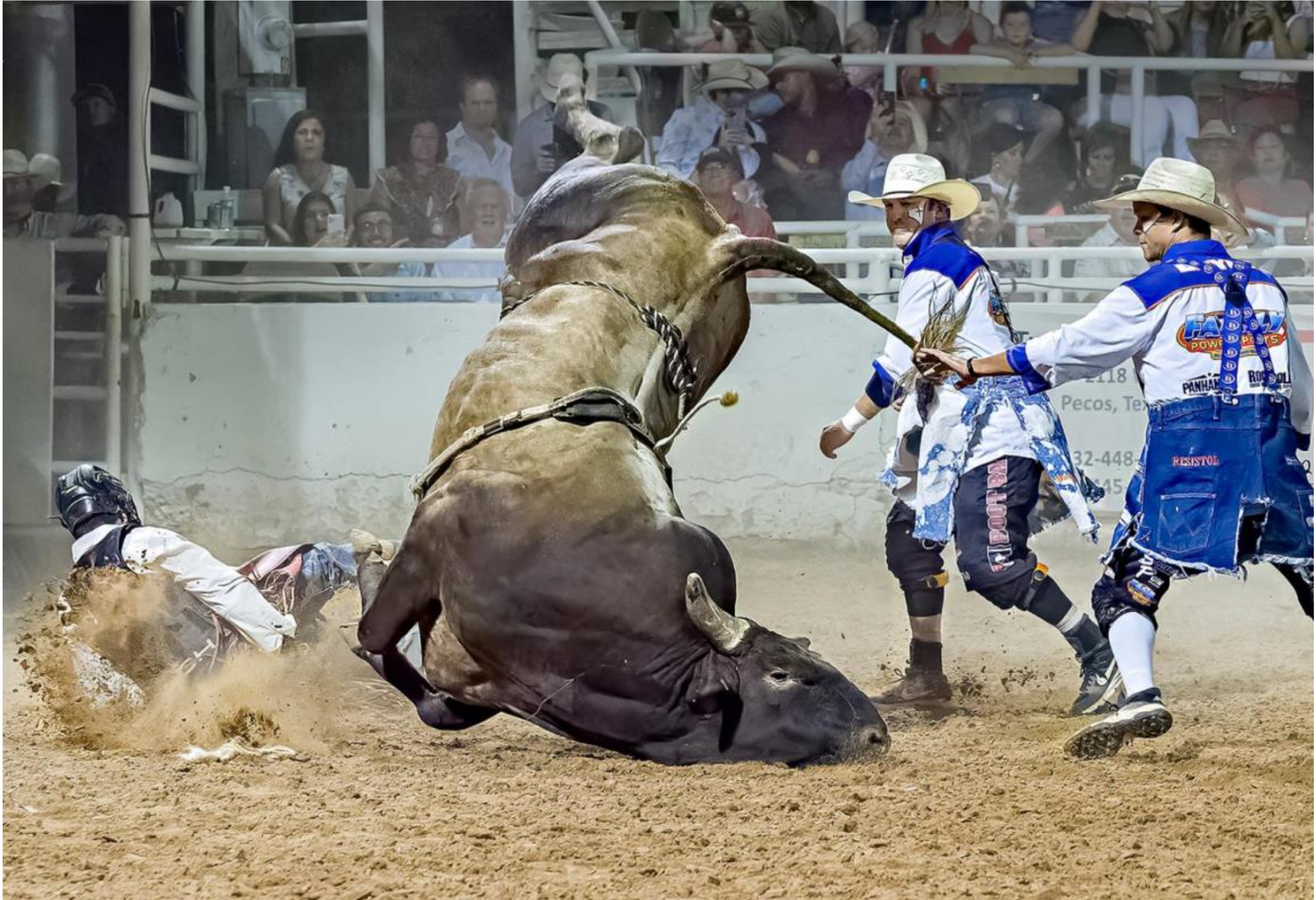
HONORABLE MENTION - BULL NOSE DIVE by TOM SAVAGE (USA)