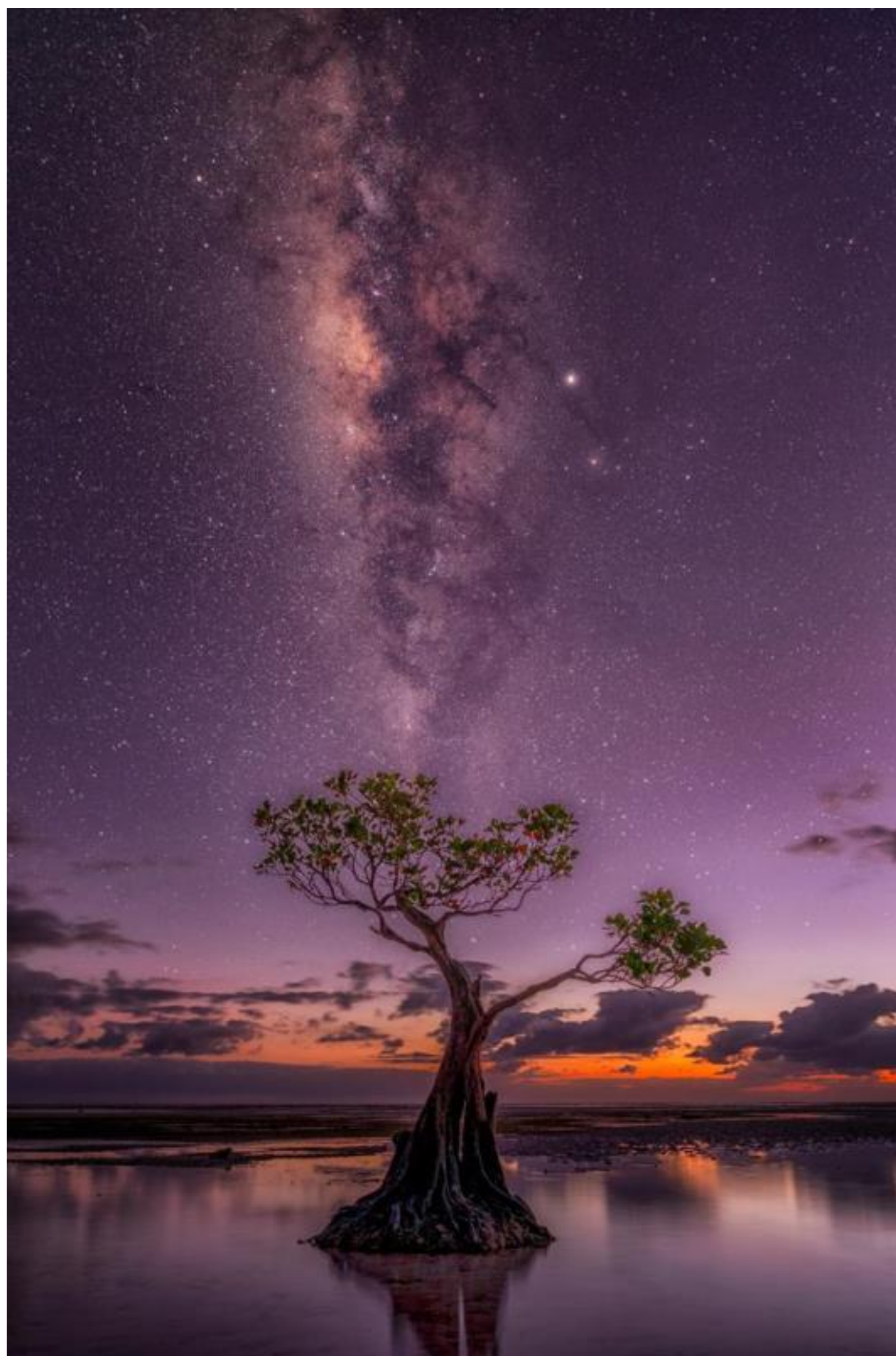
PSA SILVER - MALAKIRI BEACH MILKYWAY SUMBA by CHIONG SOON TIONG (MALAYSIA)