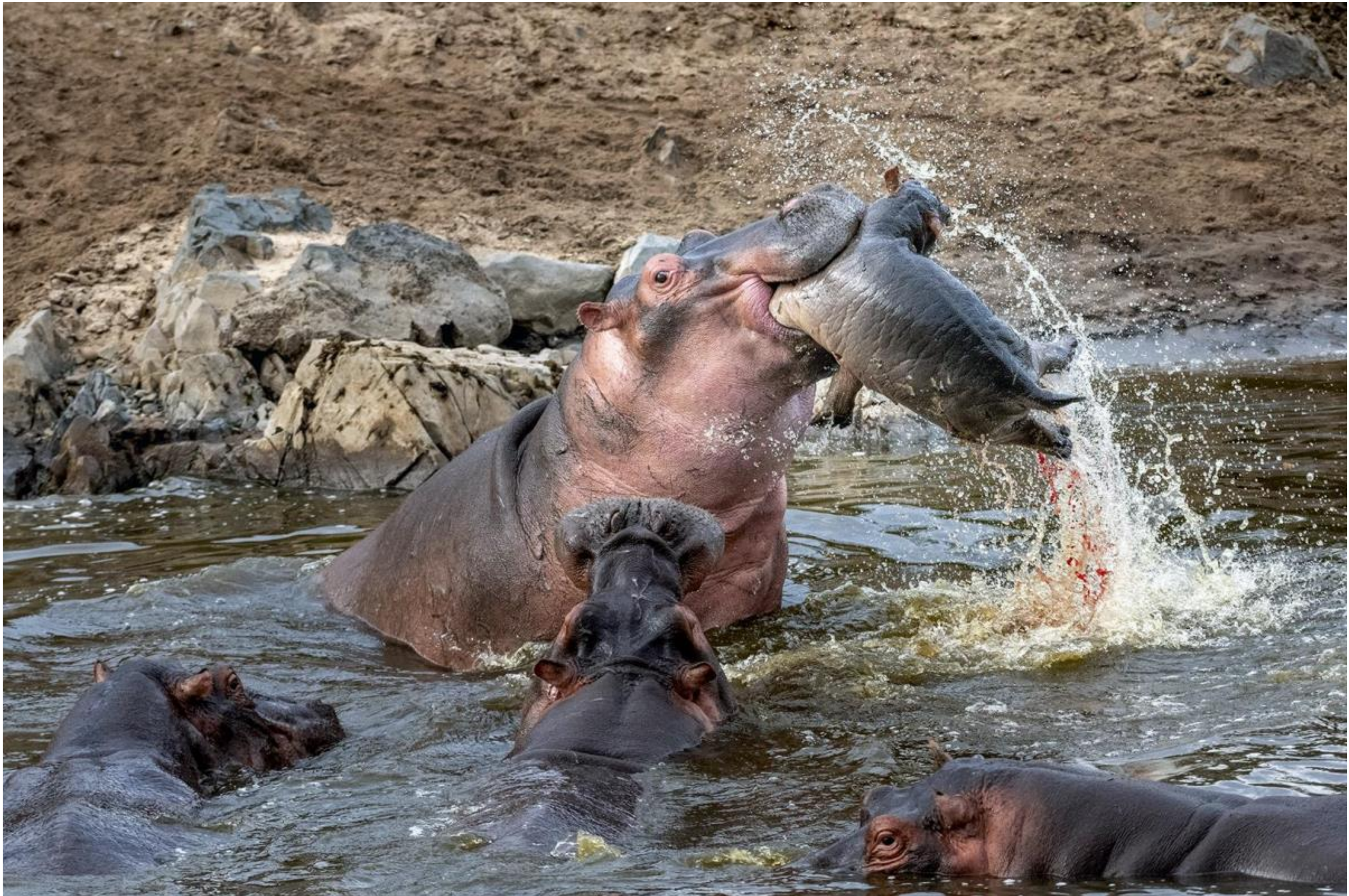
CHAIRMANS AWARD - PUNISHMENT by EVGENY BORISOV (RUSSIAN FEDERATION)