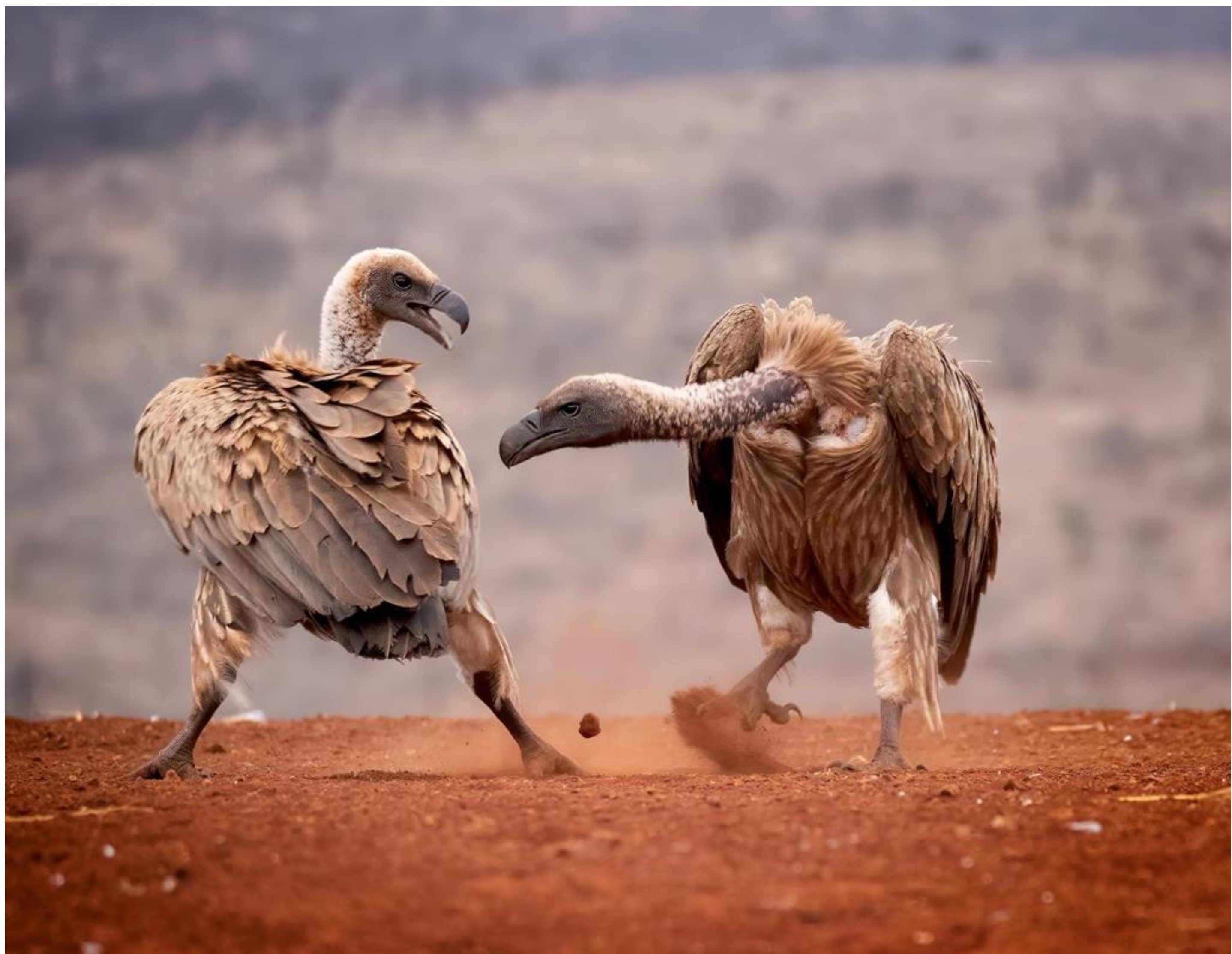
DIGITAL CHAIRMANS AWARD - VULTURE DISPUTE by ROBIN PRICE (ENGLAND)