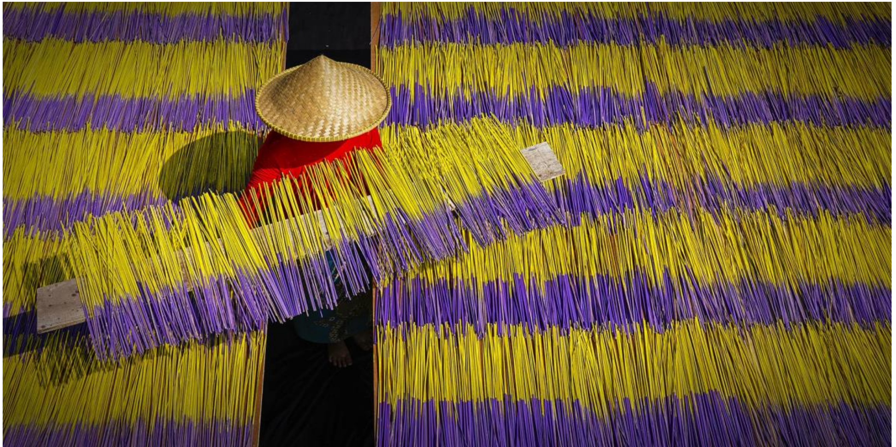
DIGITAL CHAIRMANS AWARD - DRYING INCENSE by IKA CAHYAWATI (INDONESIA)