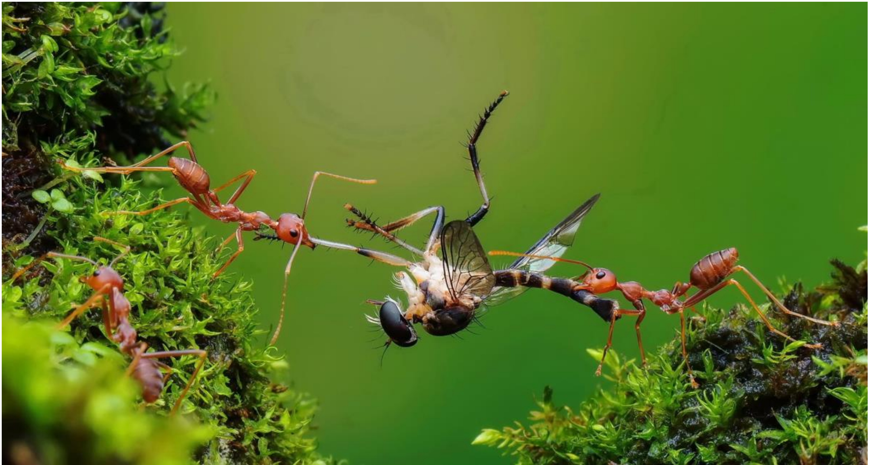
HONORABLE MENTION - THIS IS MINE by LOH TUCK YEONG (MALAYSIA)