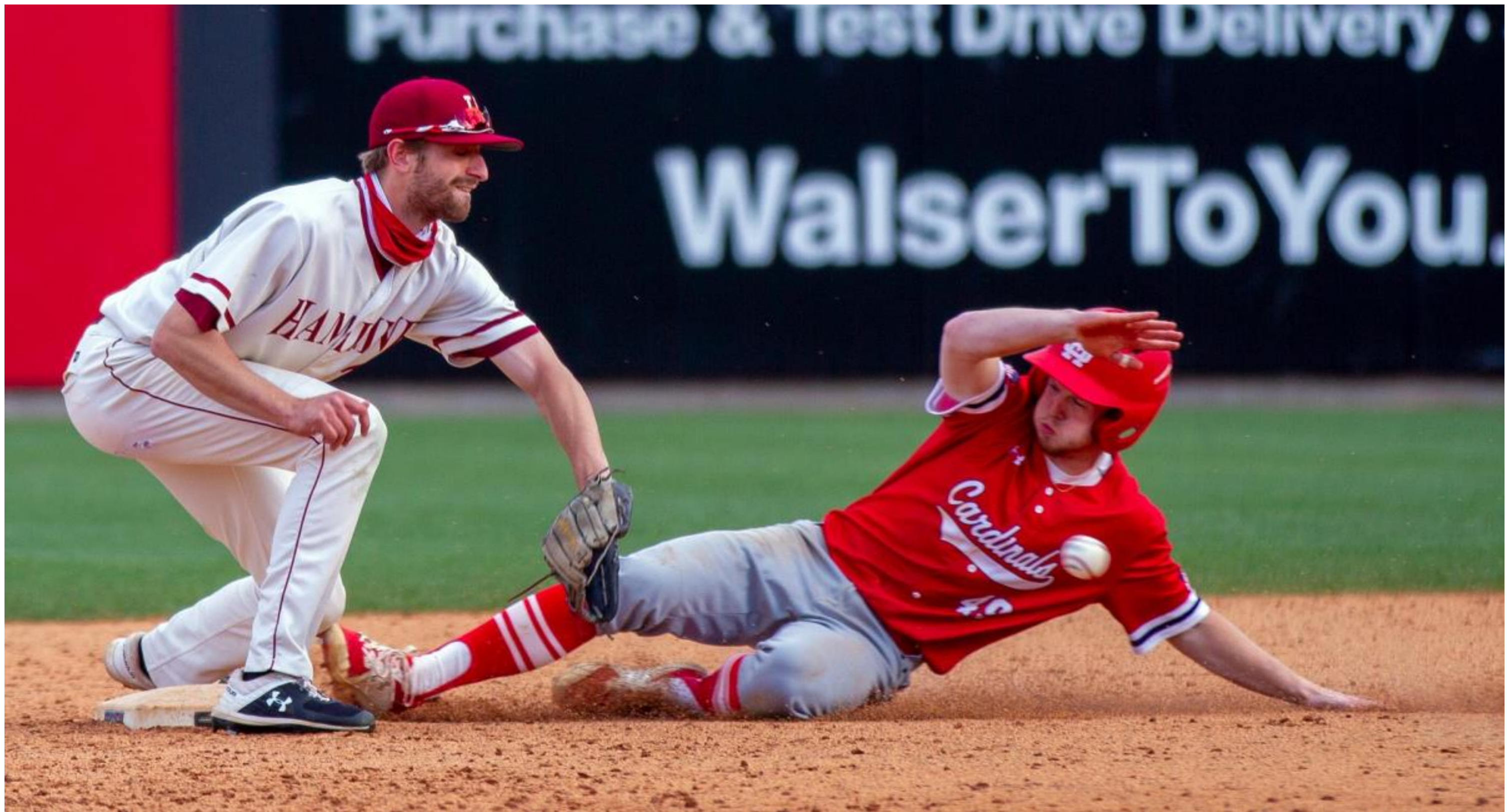
HONORABLE MENTION - ST MARYS AT 2ND by KAREN LEONARD (USA)