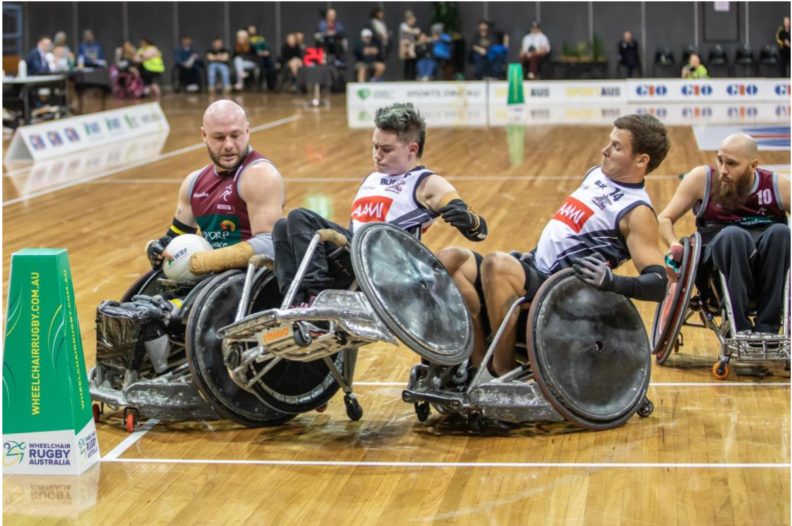
HONORABLE MENTION - NO SCORE FOR BOND by WILLIAM ALEXANDER STEWART (AUSTRALIA)