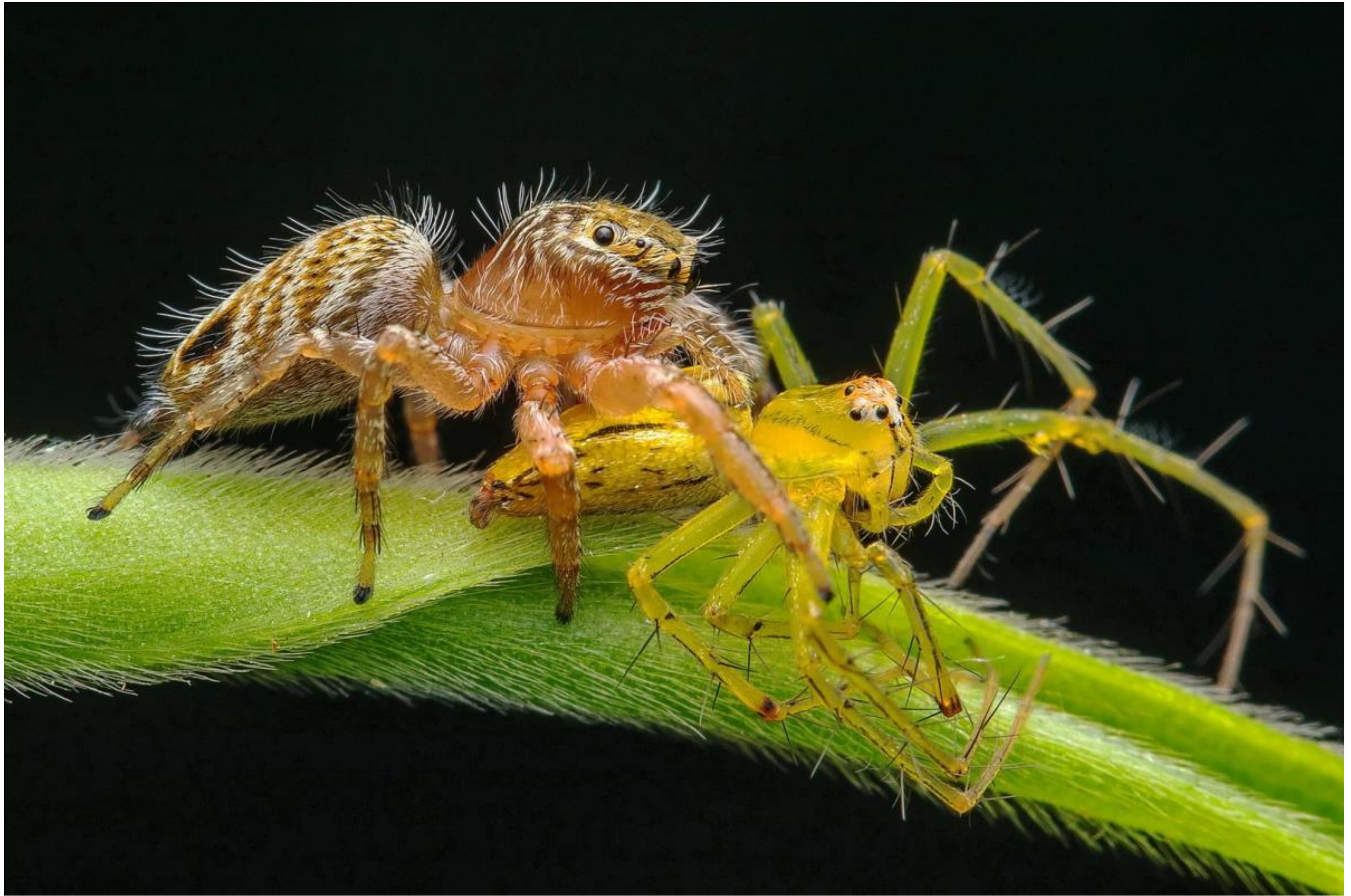
DIGITAL CHAIRMANS AWARD - GOOD CATCH by LOH TUCK YEONG (MALAYSIA)