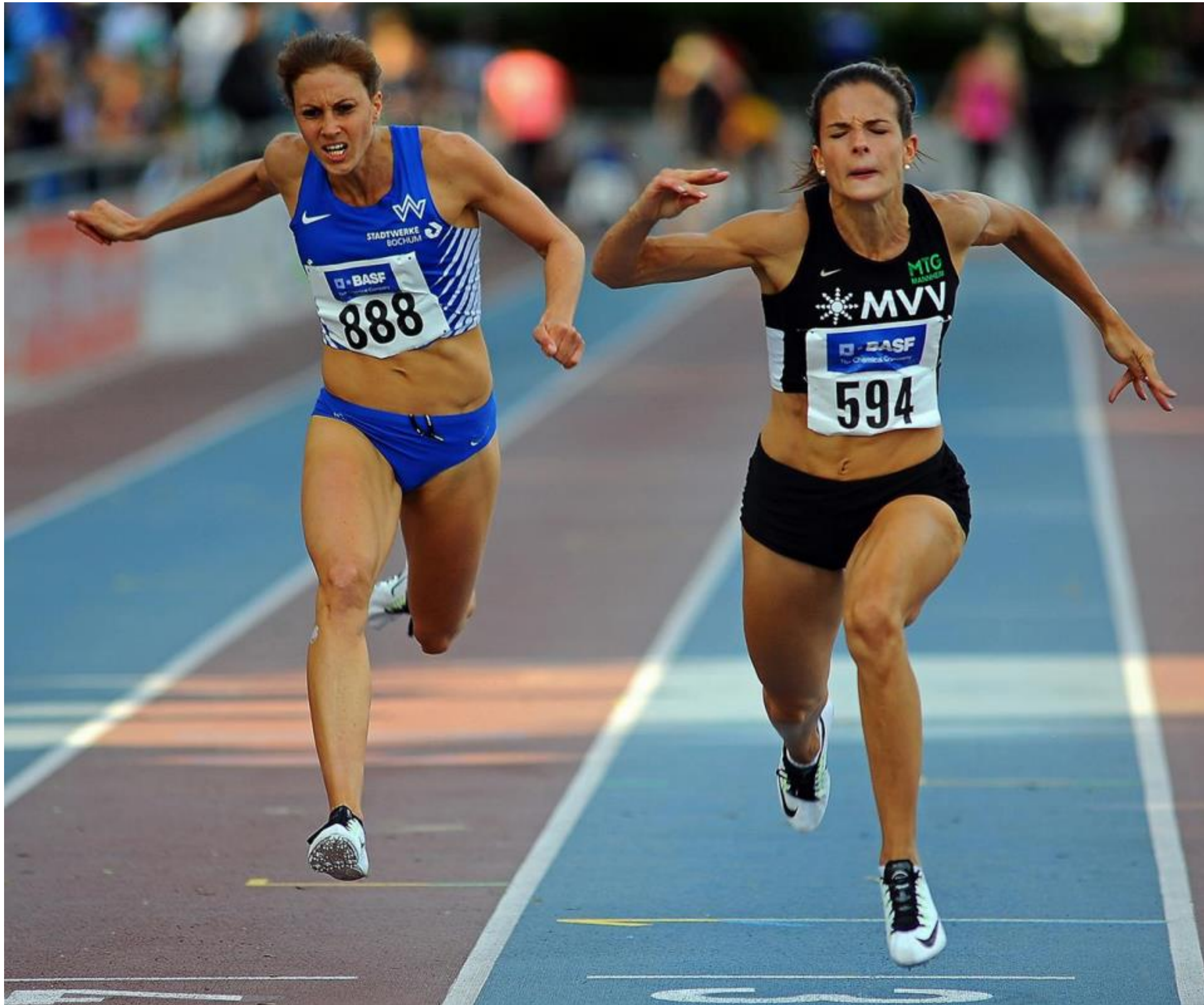
PSA SILVER - SPRINT 2016 by GERHARD BOEHM (GERMANY)