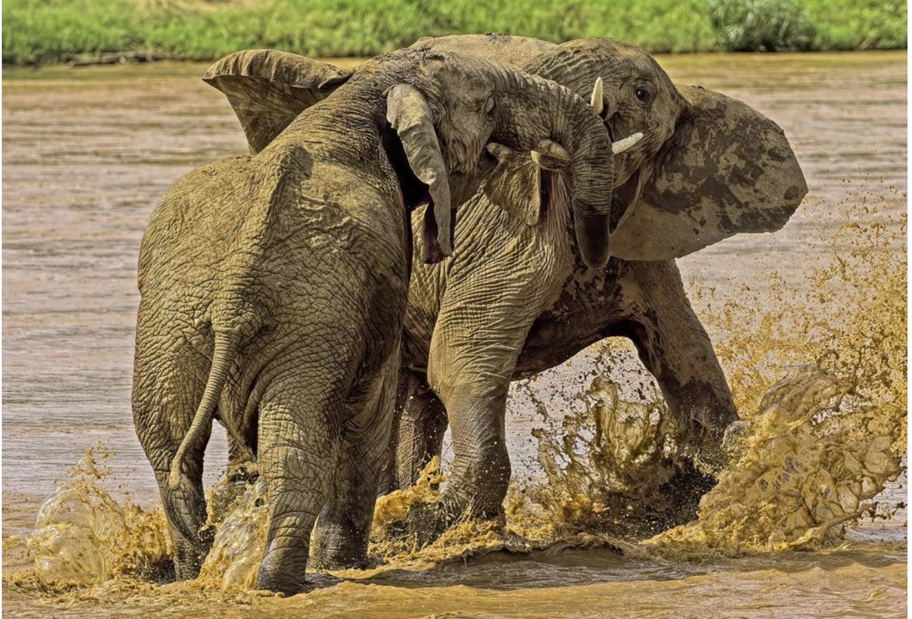
DIGITAL CHAIRMANS AWARD - ELEPHANT FIGHT 2 by GRAEME GUY (MALAYSIA)