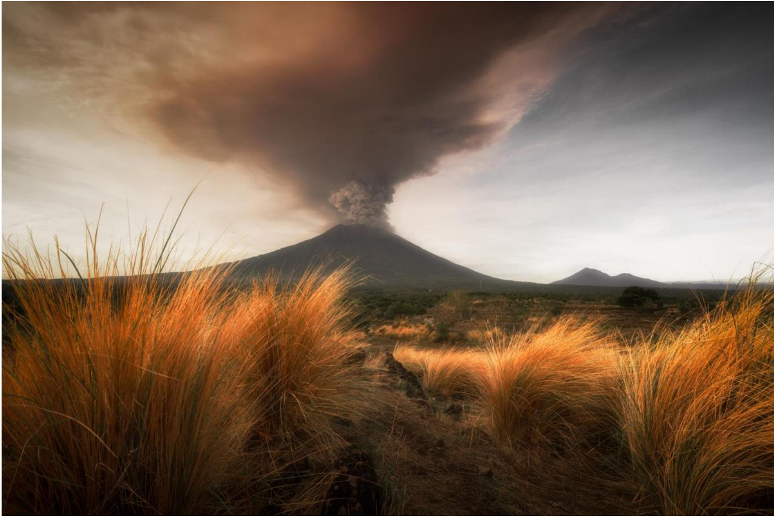
HONORABLE MENTION - MT AGUNG ERUPTION BALI 5 by CHIONG SOON TIONG (MALAYSIA)