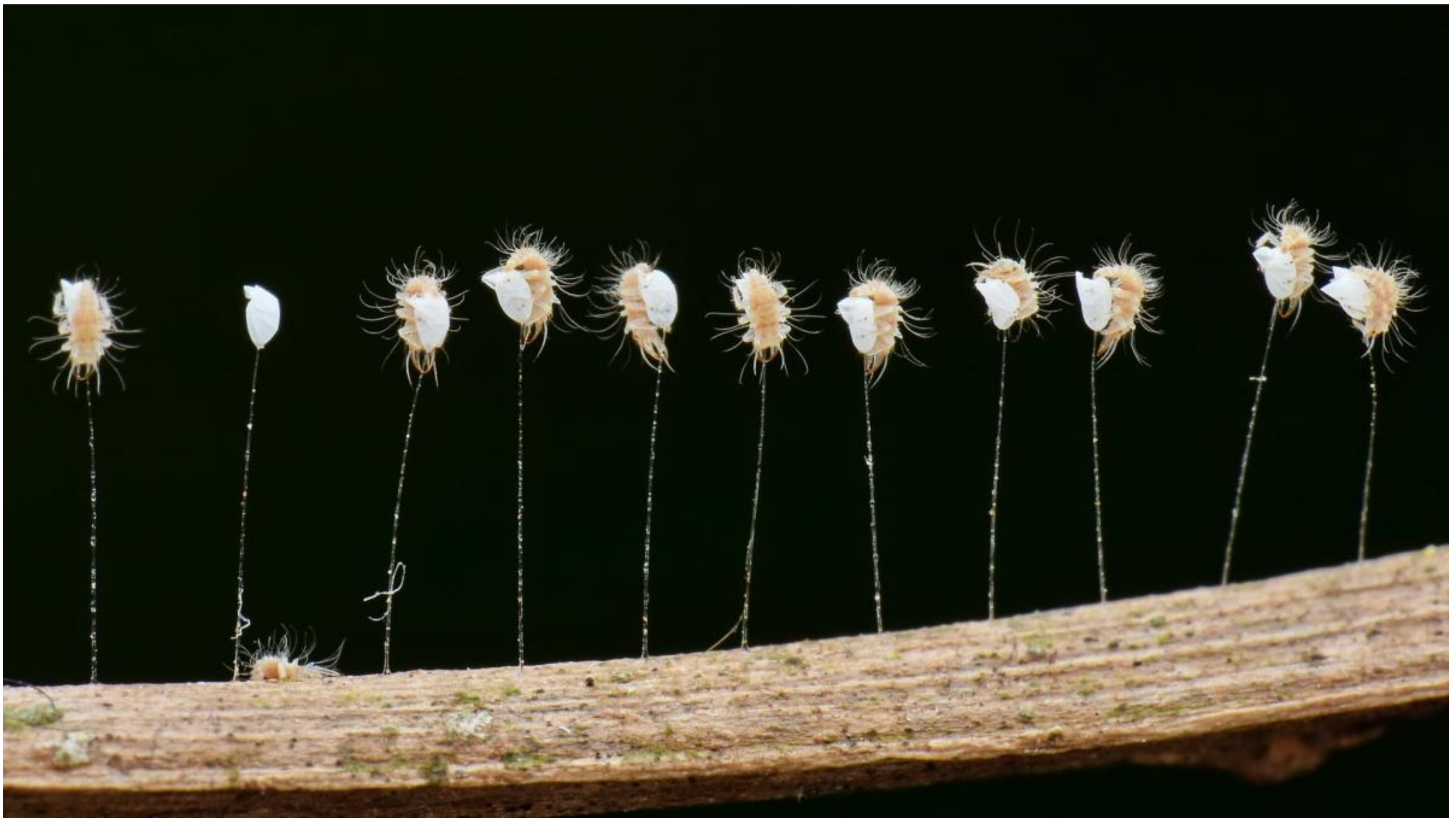
JUDGES CHOICE AWARD - LACEWING 6582 by DIK SEN NGU (MALAYSIA)