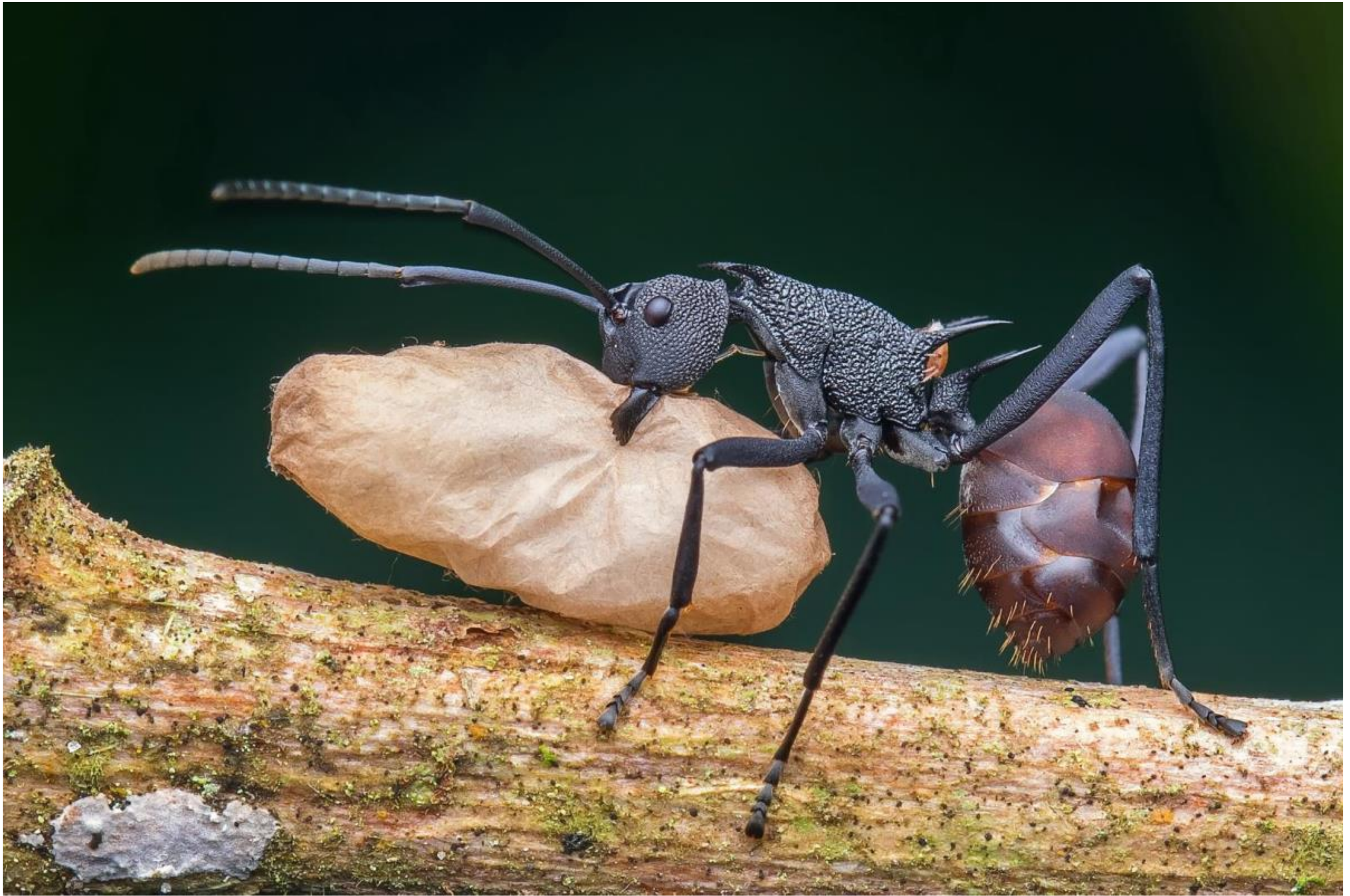
JUDGES CHOICE AWARD - EGG PROTECTOR 2 by LOH TUCK YEONG (MALAYSIA)