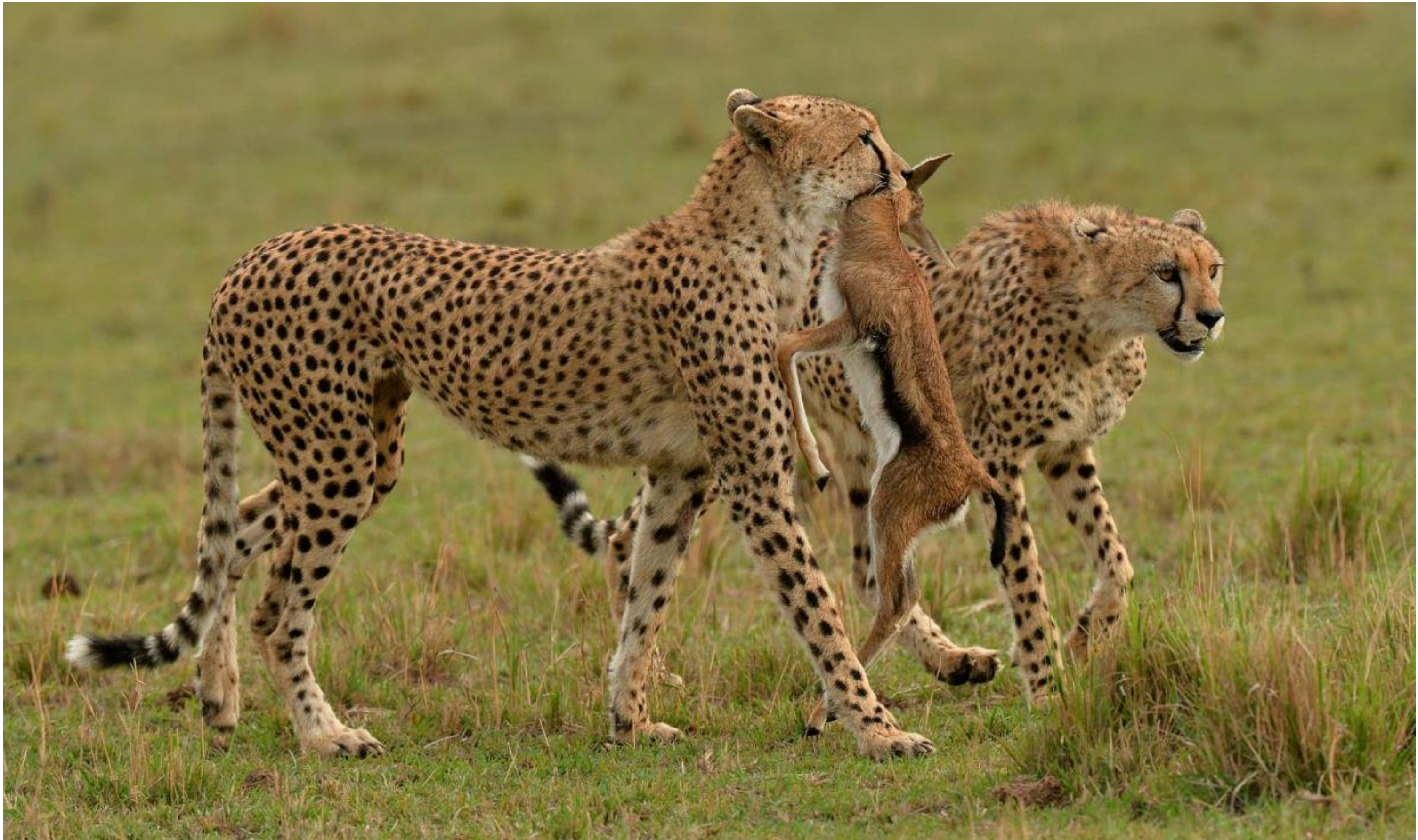
HONORABLE MENTION - CHEETAHS CARRYING KILL by IAN WHISTON (ENGLAND)