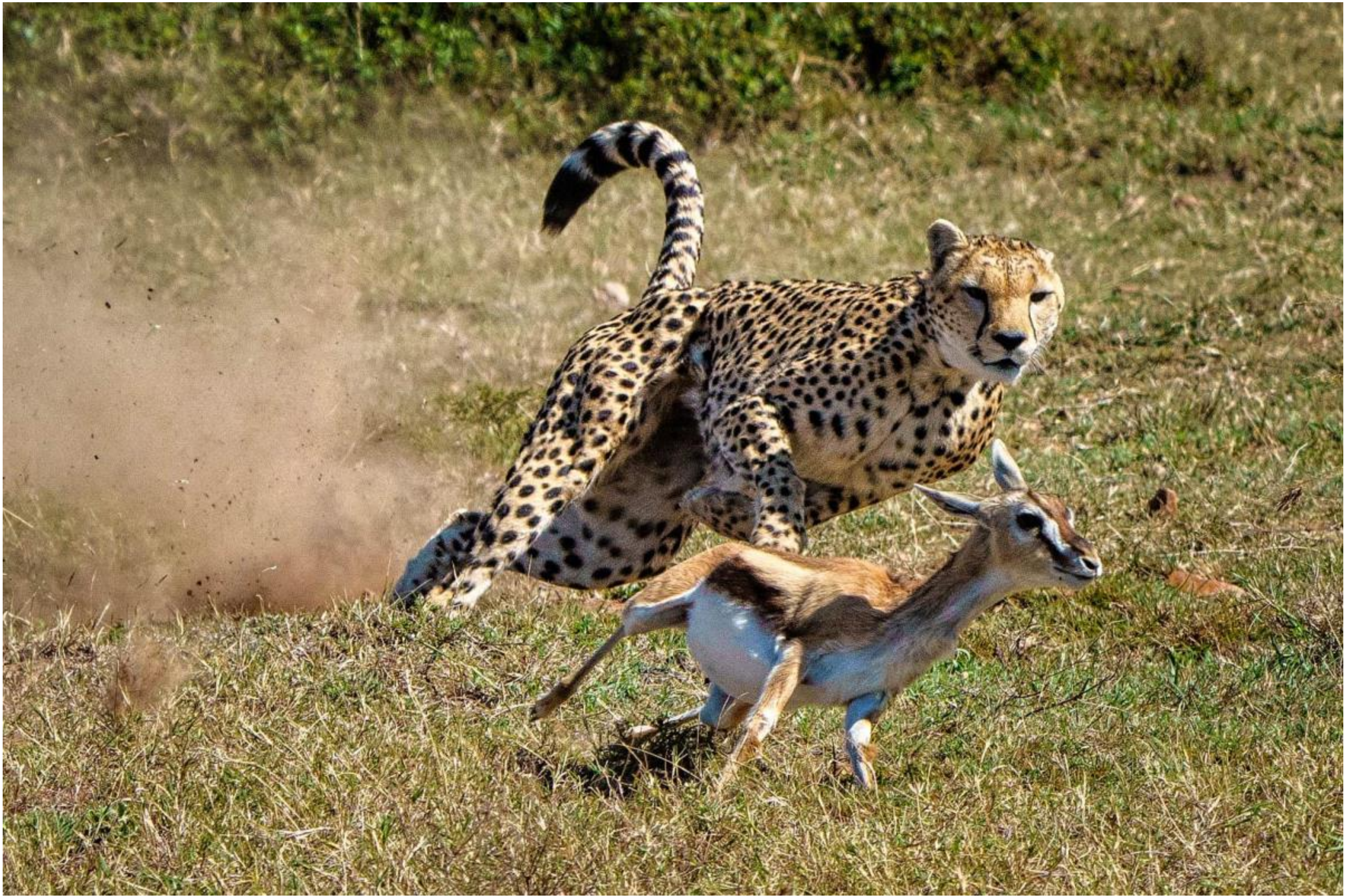
PSA GOLD - DUMA CHASING GAZELLE MASTER 9-4-21--ENHANCED by LARRY MIYAMURA (USA)