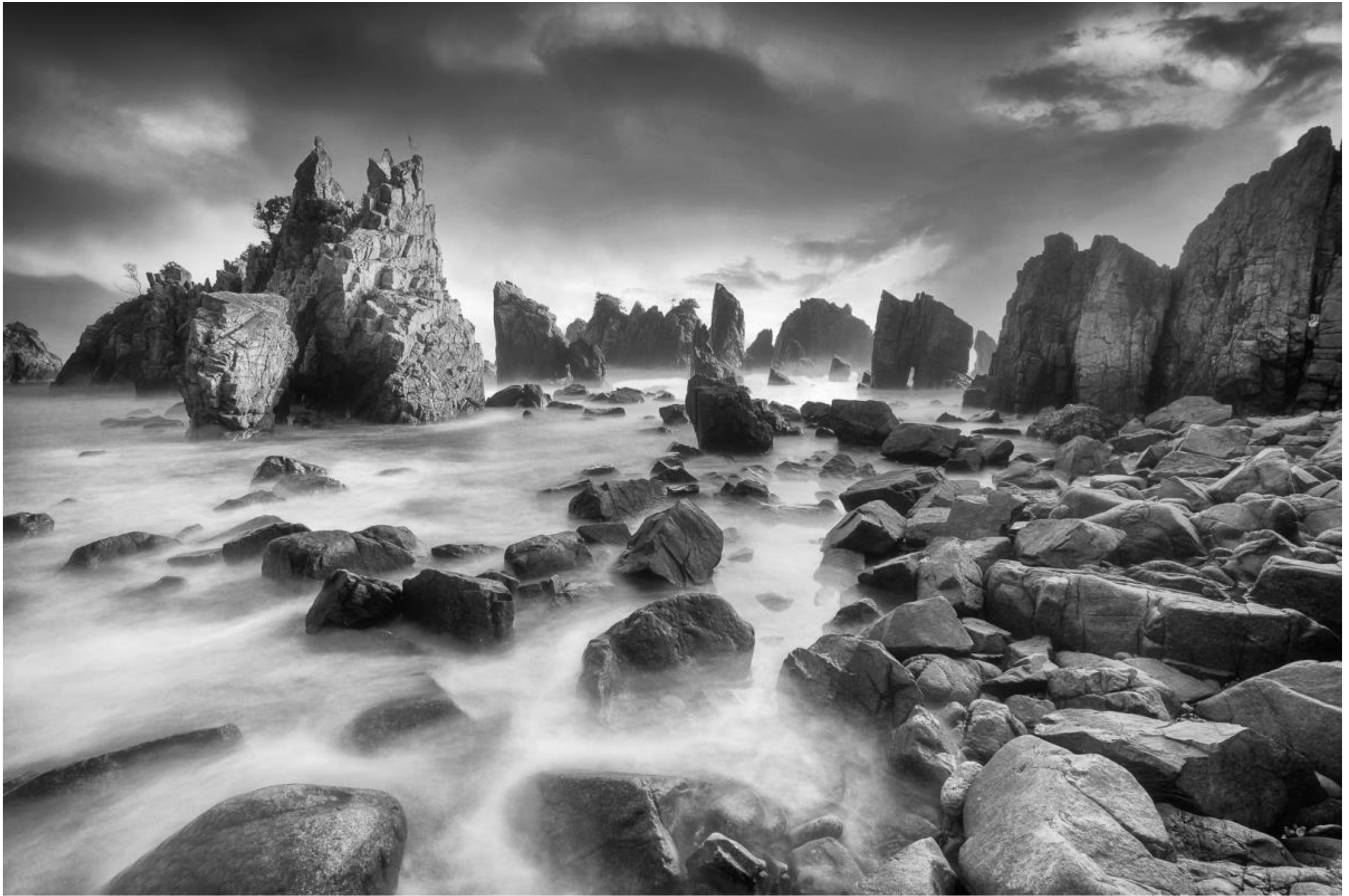
PSA BRONZE - GIGI HIU BEACH LAMPUNG by CHIONG SOON TIONG (MALAYSIA)