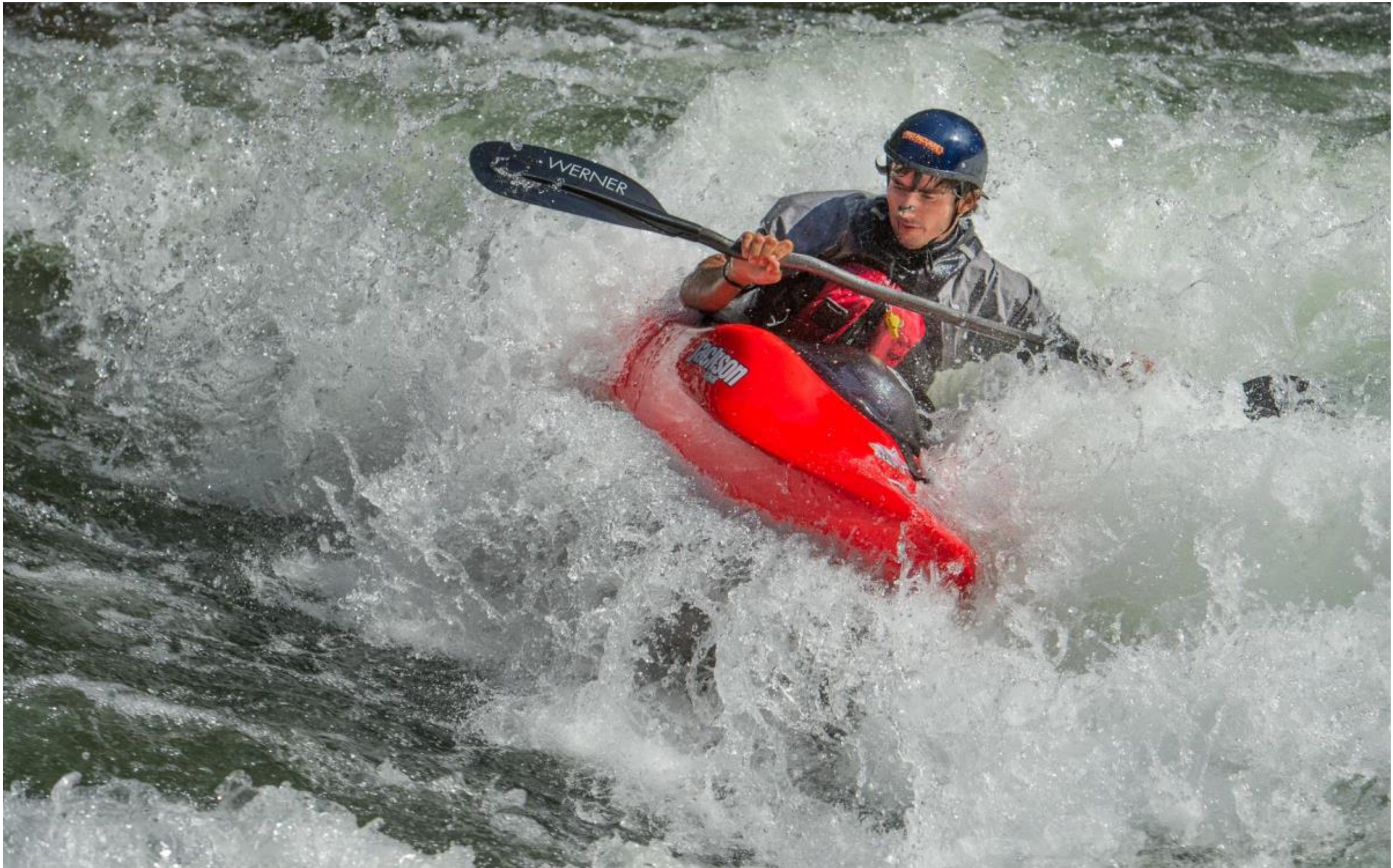
HONORABLE MENTION - IN BOILING WATER by FRANCIS KING (CANADA)