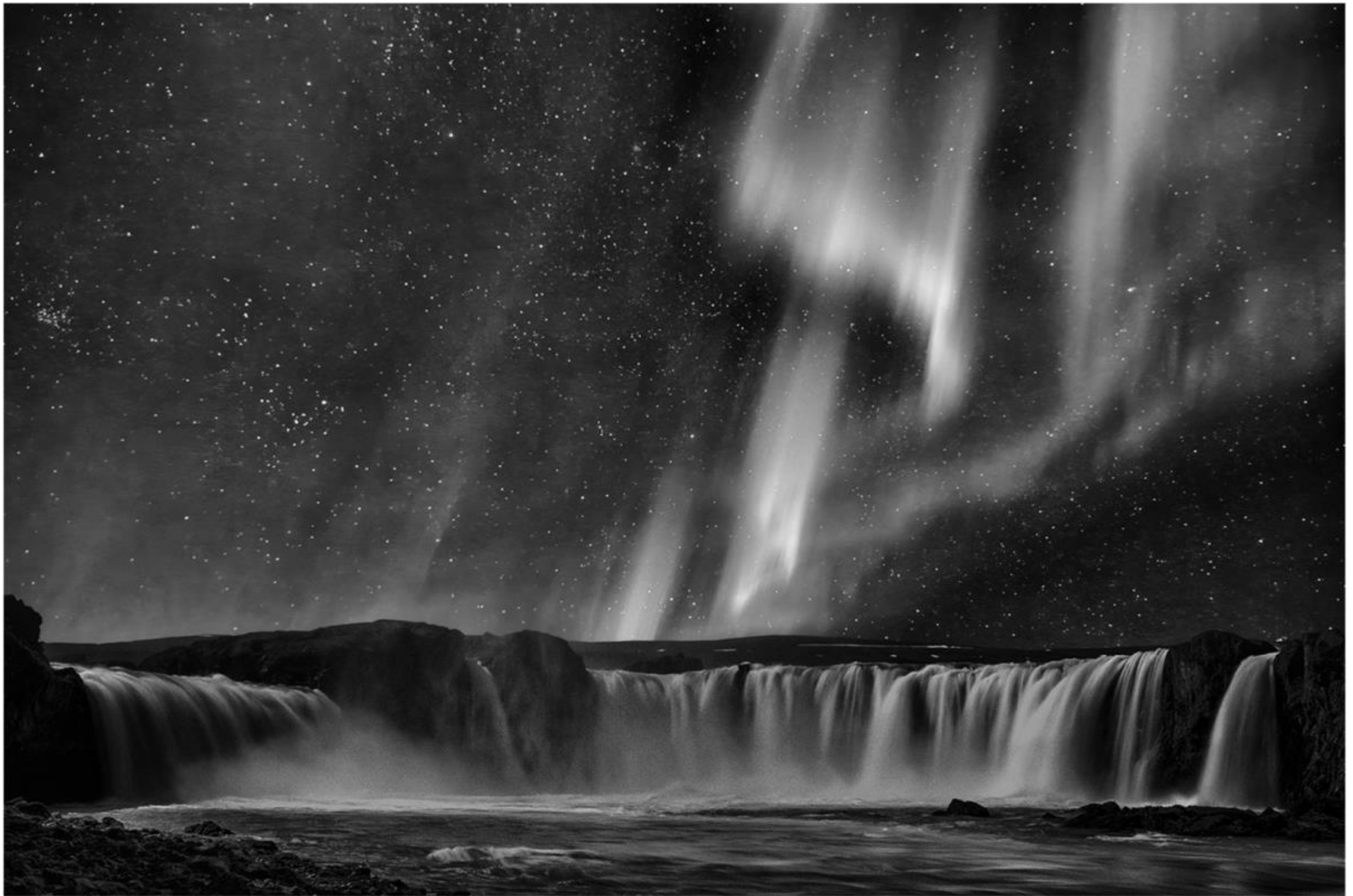
PSA GOLD - NORTHERN LIGHTS OVER GODAFOSS by PETER CLARK (ENGLAND)