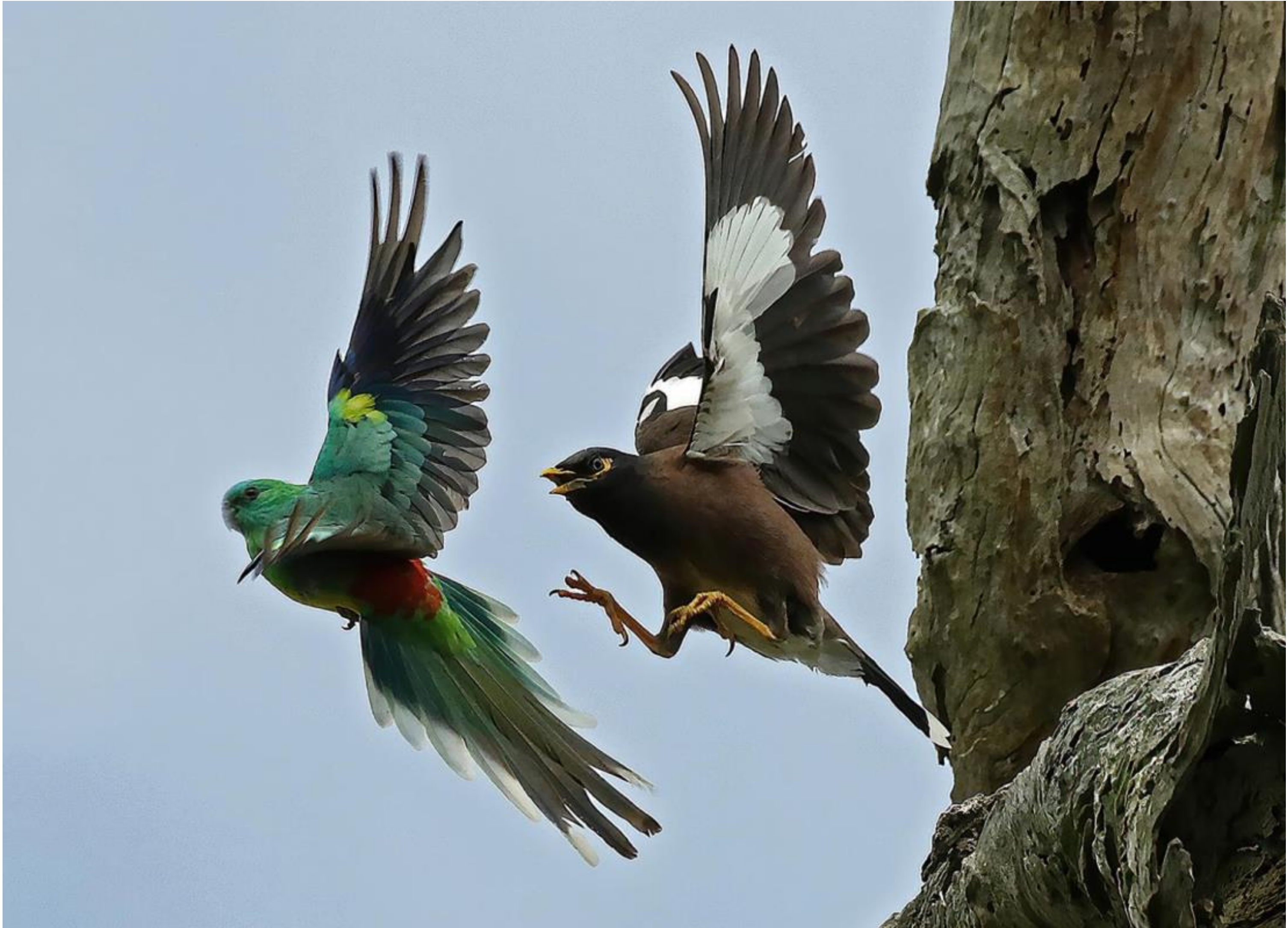
HONORABLE MENTION - MYNA, THREAT TO NATIVE BIRDS by JIM THOMSON (AUSTRALIA)