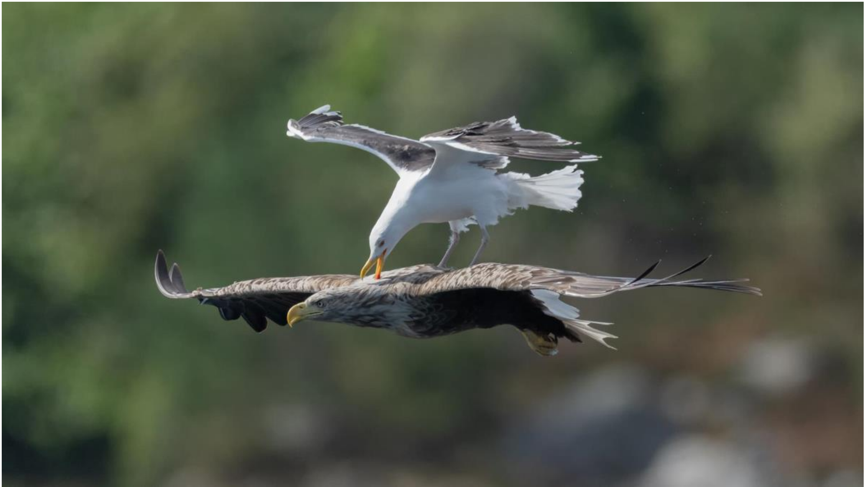
JUDGES CHOICE AWARD - EAGLE SURFING by VEGARD HANSSEN (NORWAY)