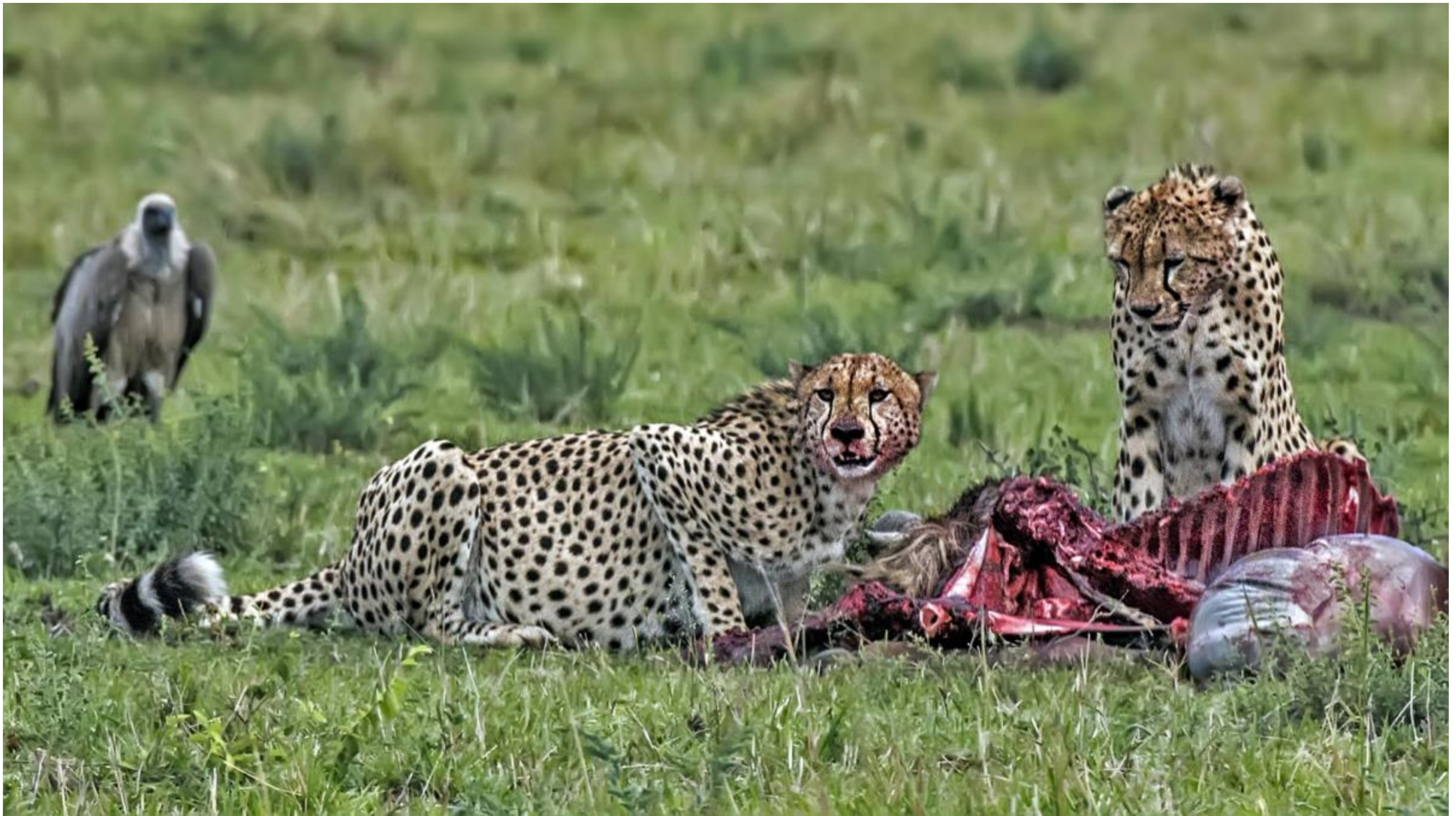
HONORABLE MENTION - KILL PARTY 201904 by SUMAN BHATTACHARYYA (INDIA)