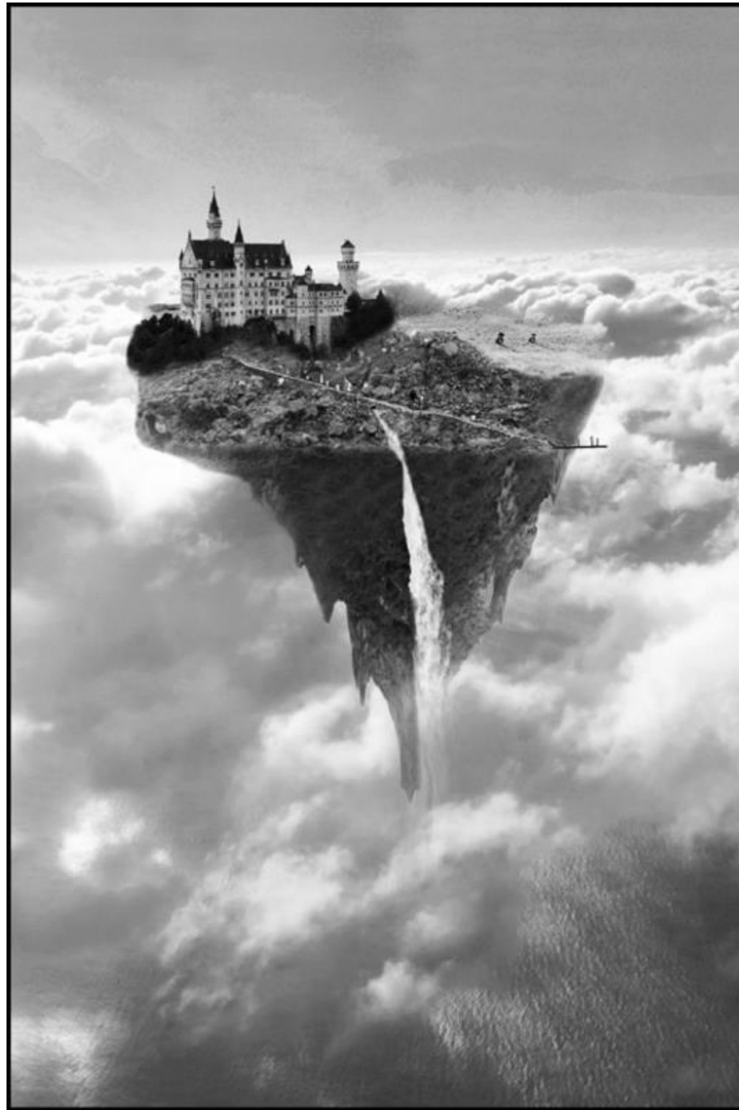
HONORABLE MENTION - FANTASY ISLAND by MARKHAM MAIL (NEW ZEALAND)