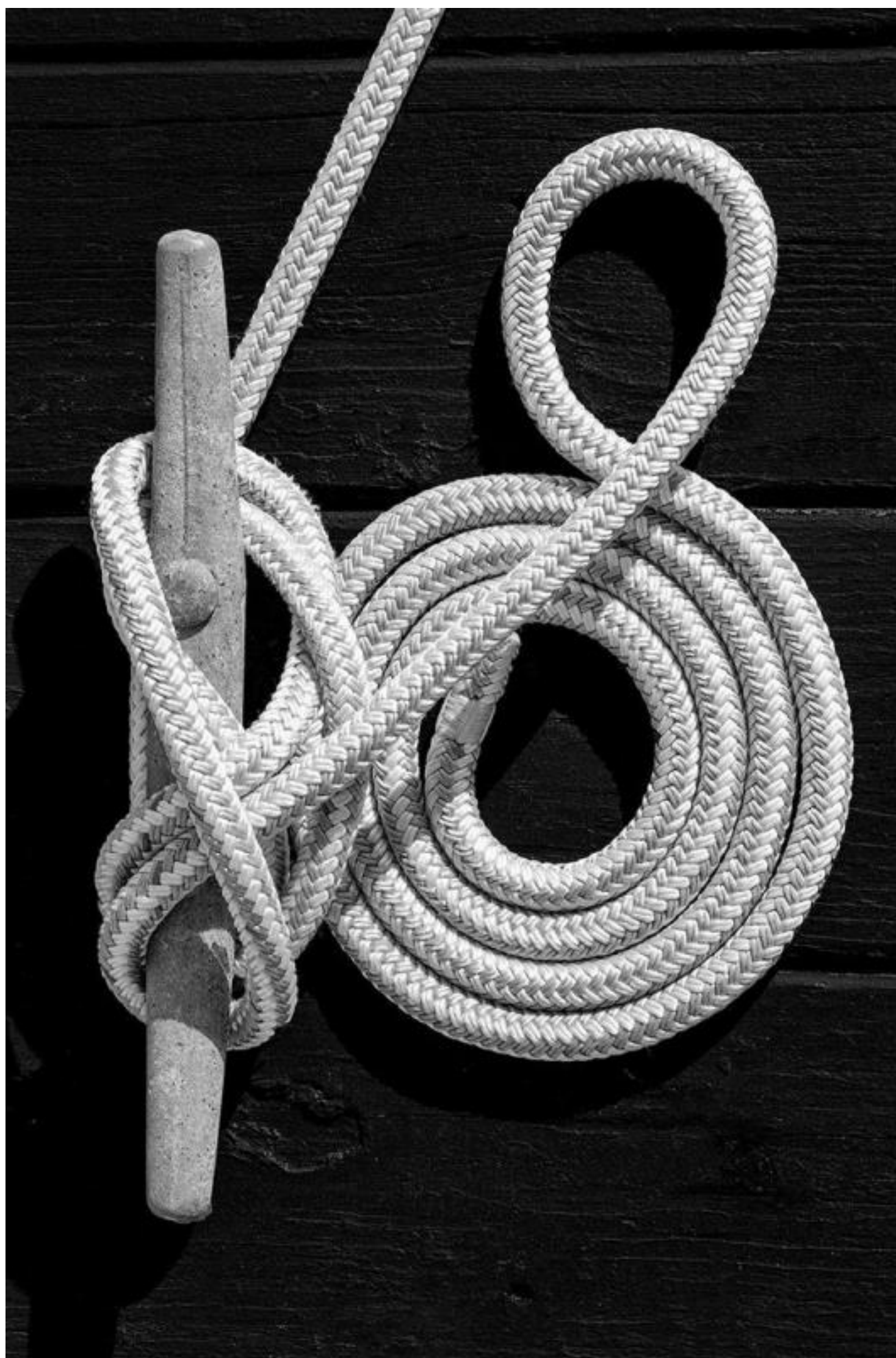
HONORABLE MENTION - THE TIE UP by RICHARD CLORAN (USA)