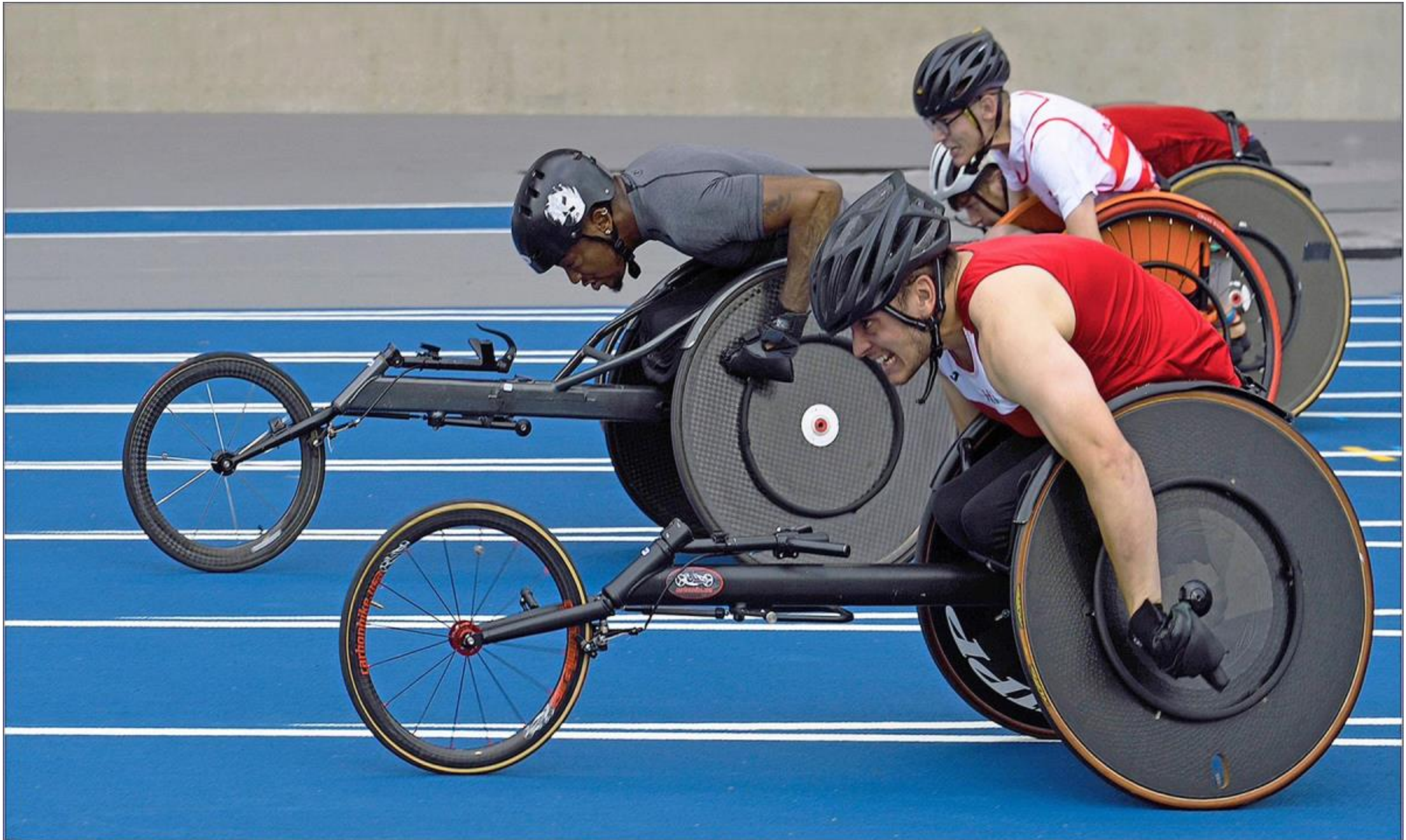
PSA GOLD - DERNIERS EFFORTS by GUY B SAMOYAUULT (FRANCE)