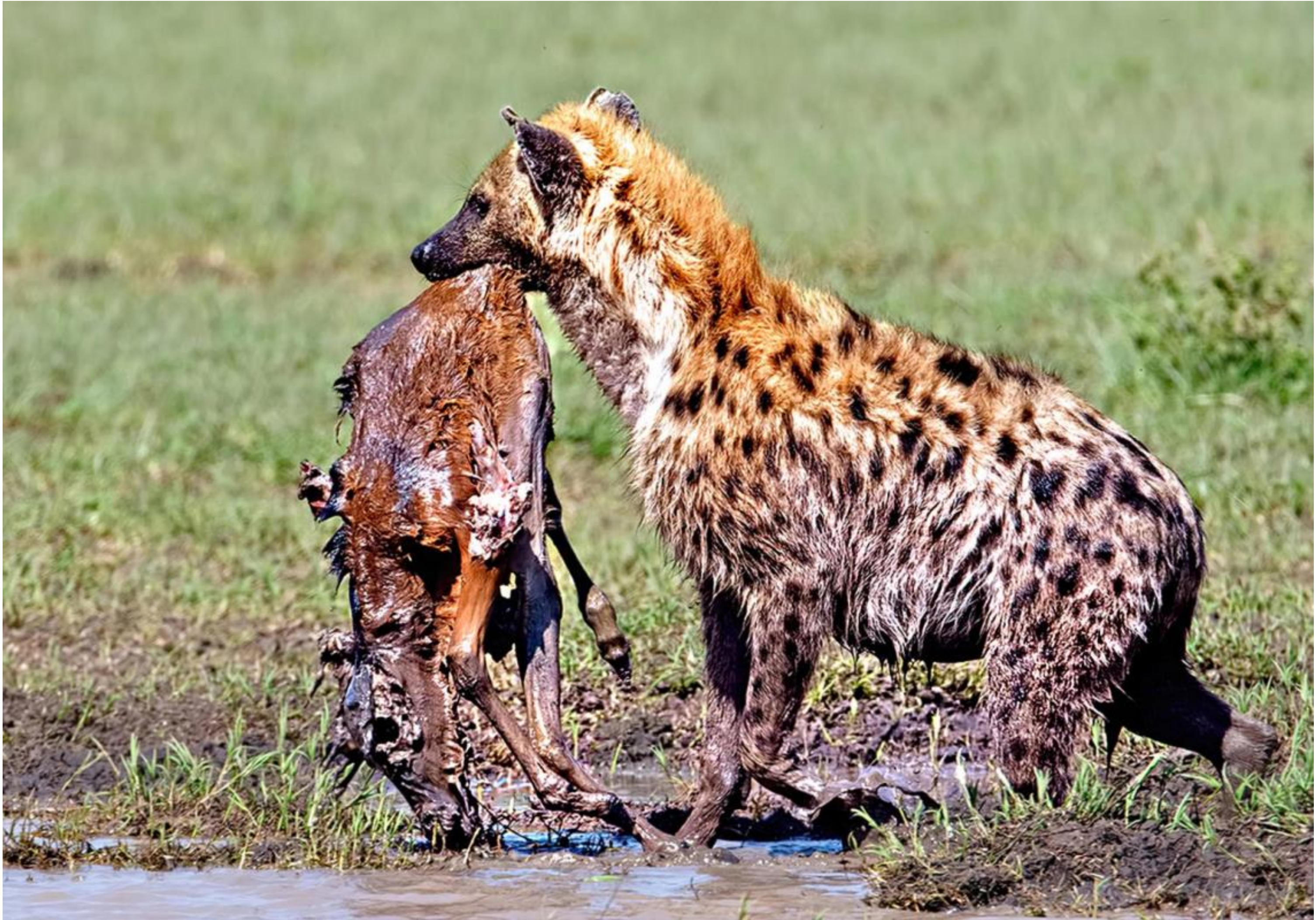
HONORABLE MENTION - HYENA WITH MUDDY KILL by TOM SAVAGE (USA)