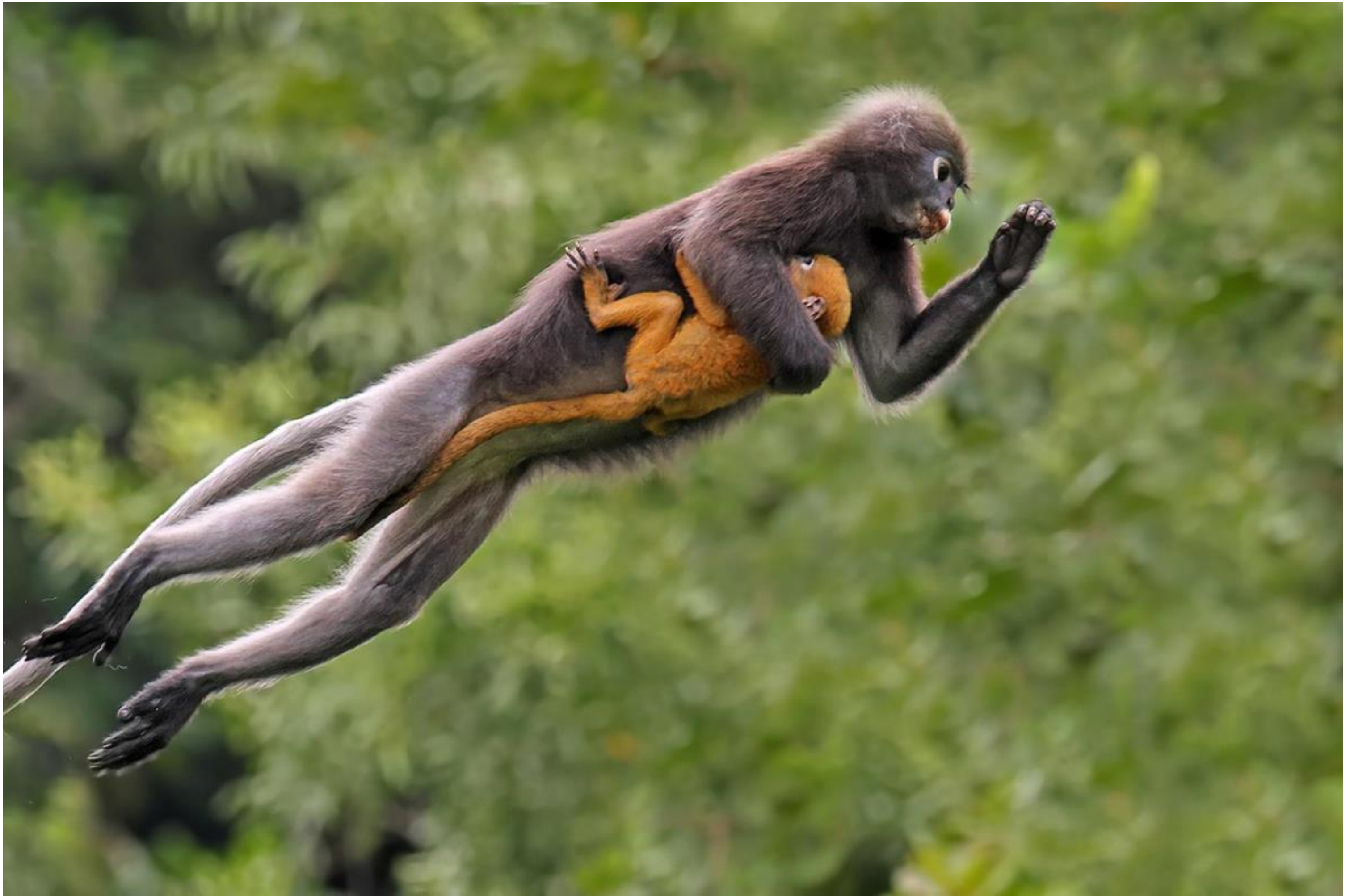
PSA BRONZE - LANGUR LEAP by GRAEME GUY (MALAYSIA)