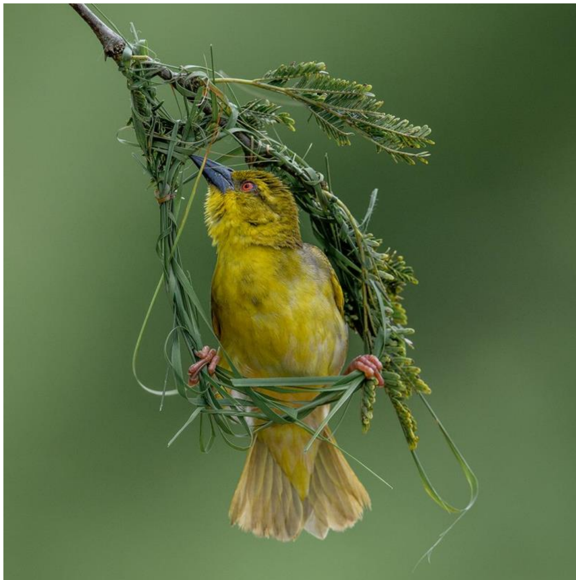
HONORABLE MENTION - WEAVING SKILL by ROY KILLEN (AUSTRALIA)