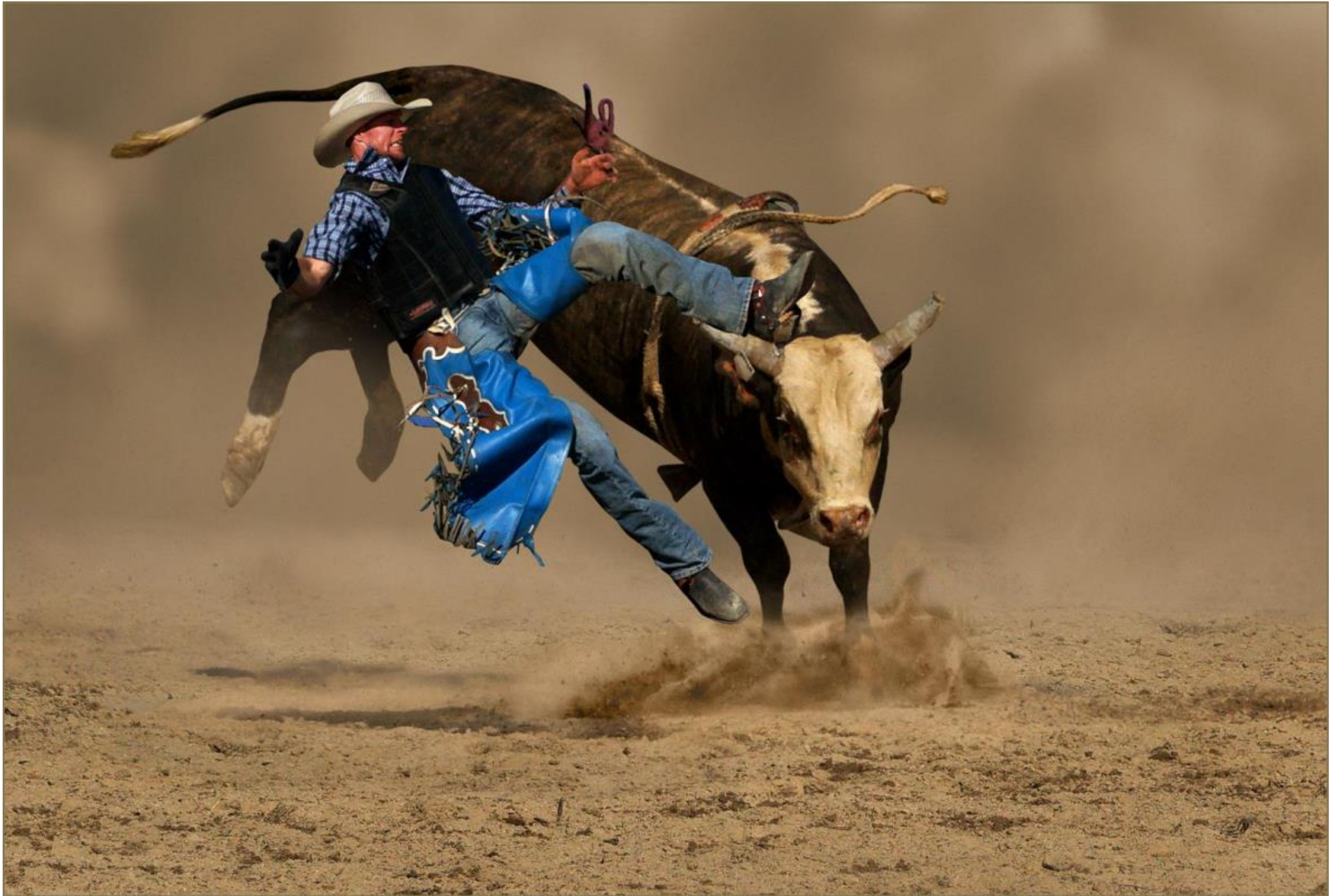
HONORABLE MENTION - TRUE BLUE by RAE STANAWAY (AUSTRALIA)