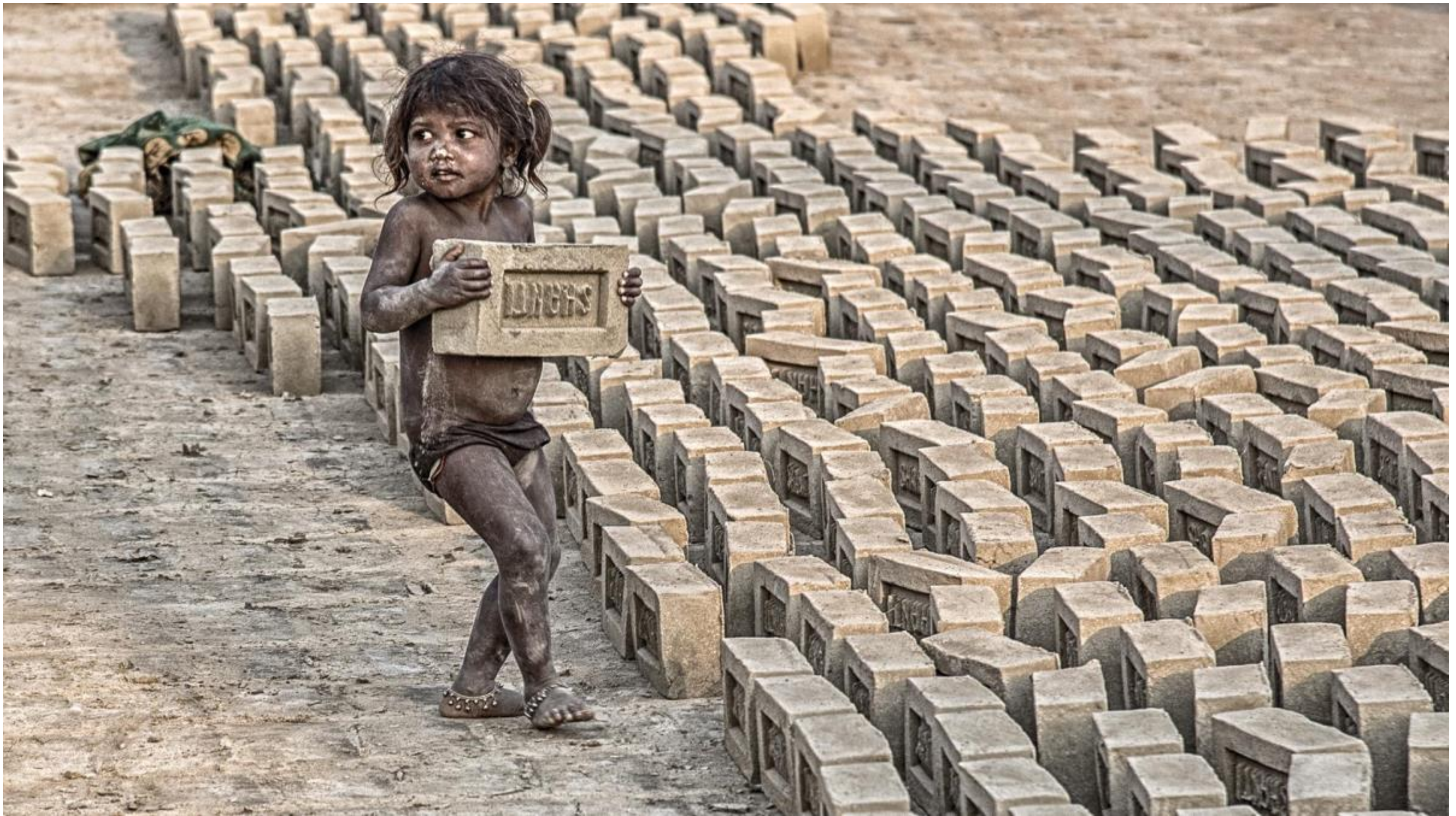
DIGITAL CHAIRMANS AWARD - CHILD LABOUR WORKING by SUMAN BHATTACHARYYA (INDIA)