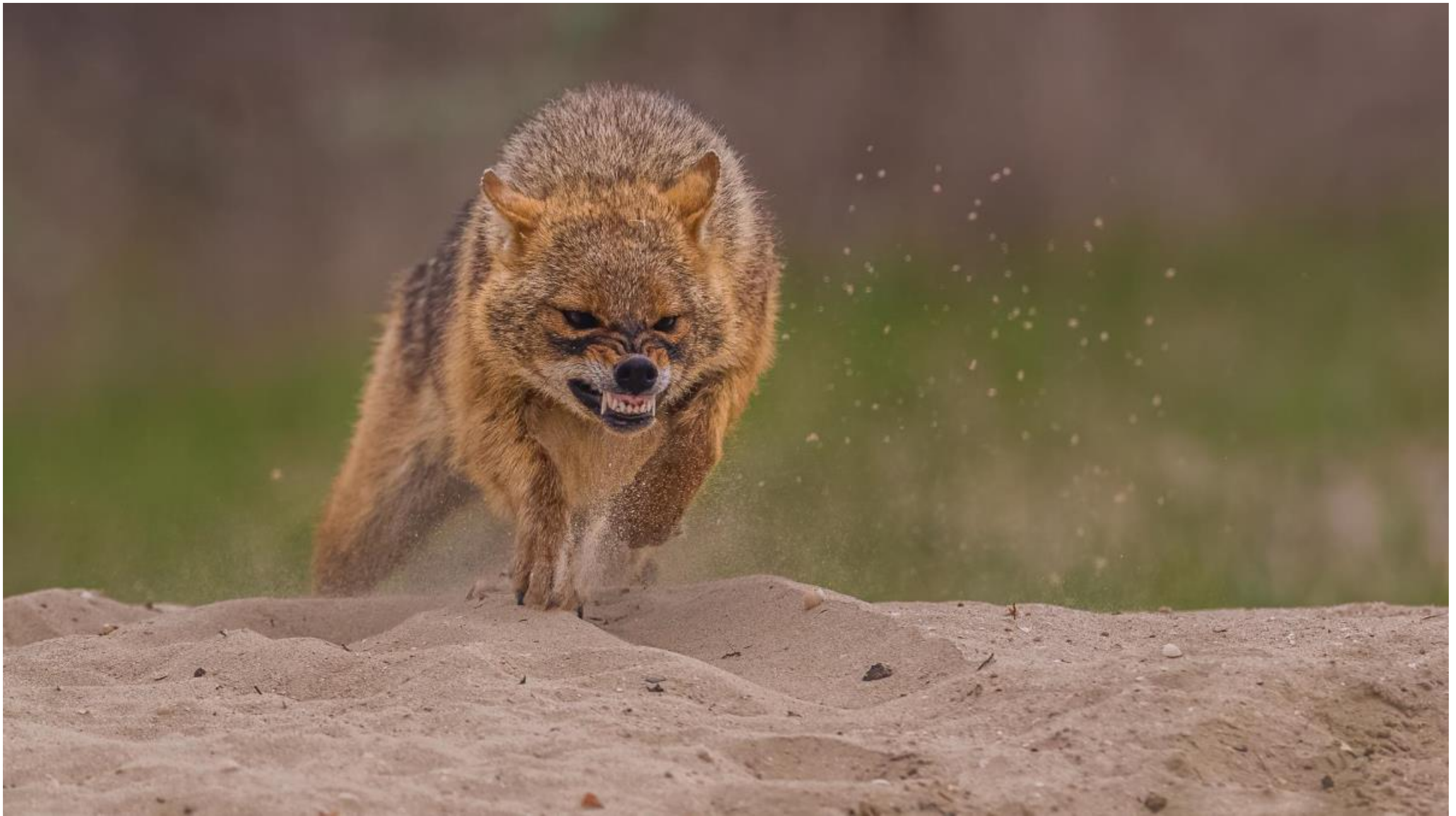
PSA BRONZE - G JACKAL RUSHING AT FOE by FRANCIS KING (CANADA)