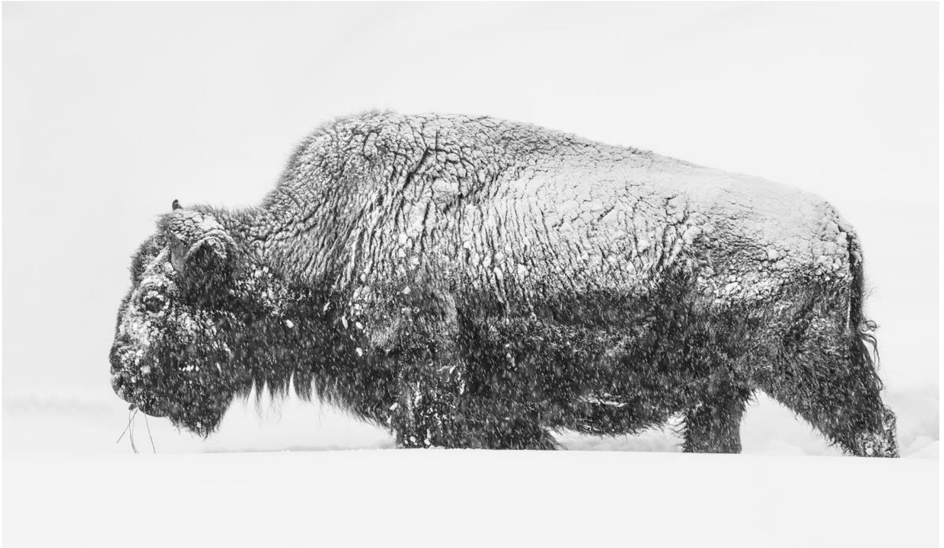
DIGITAL CHAIRMANS AWARD - BLIZZARD BISON by RICHARD CLORAN (USA)